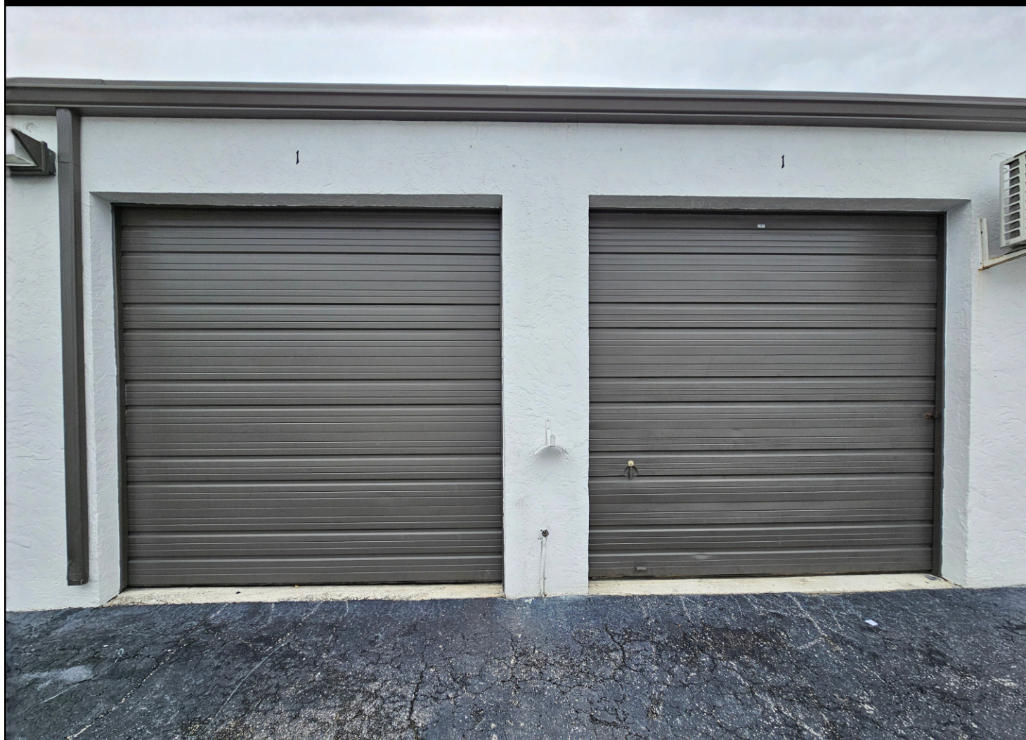
TYPICAL 775 SF UNIT ON EAST SIDE WITH 2 SIDE BY SIDE OVERHEAD DOORS