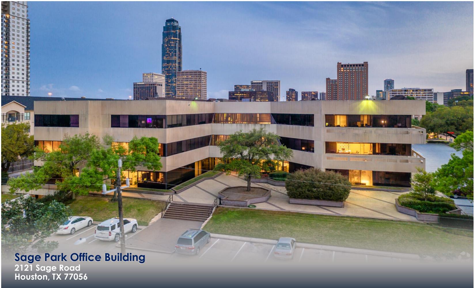
Sage Park Office Building 2121 Sage Road Houston, TX 77056

For more information contact: Erika Beggerly • erika@biiusa.com • 713-964-3052