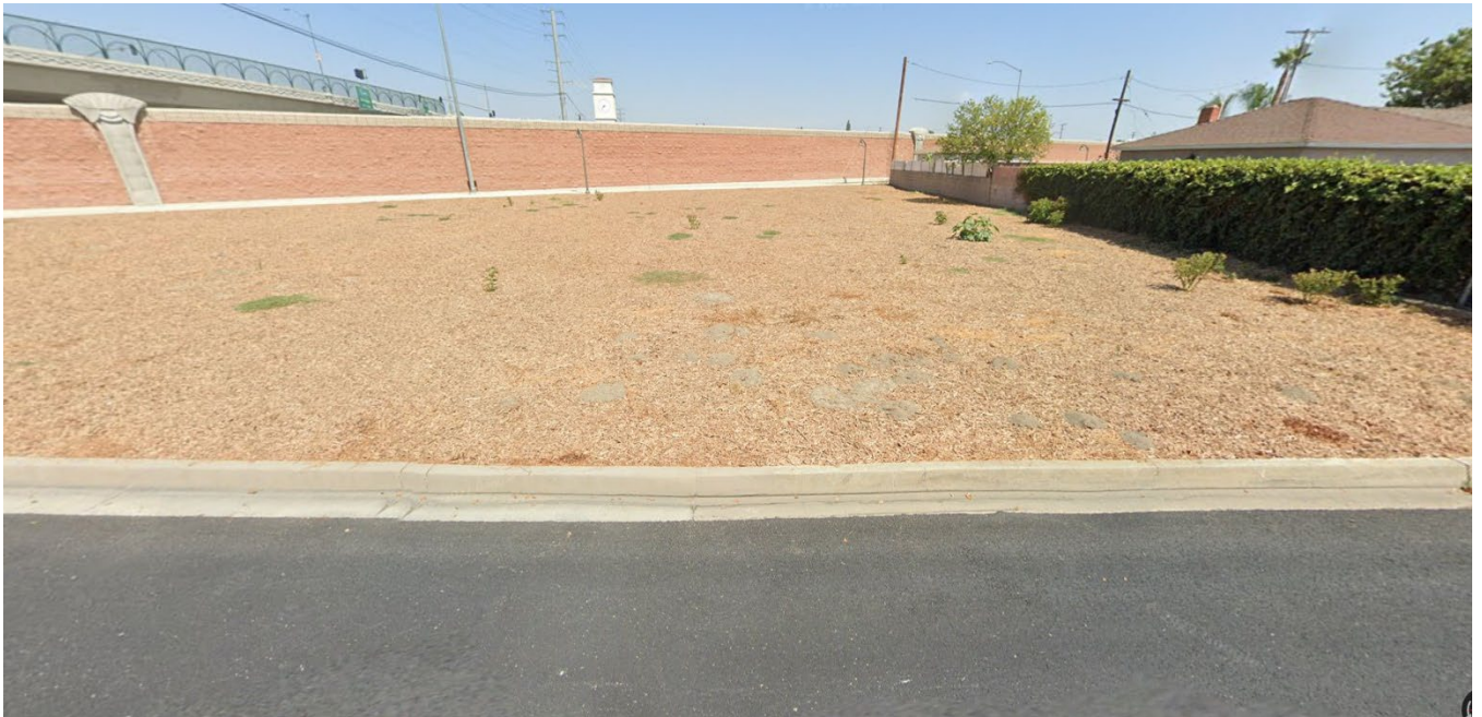
Street View from Longworth Ave