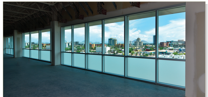
Downtown Phoenix Skyline from Fifth Floor