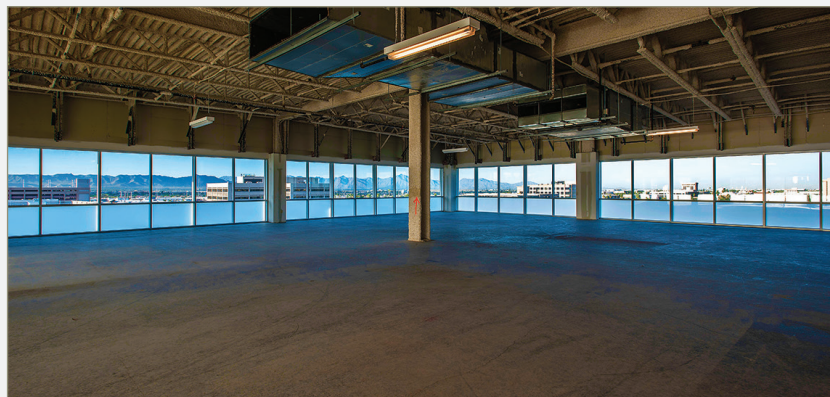
Panoramic Views of the City