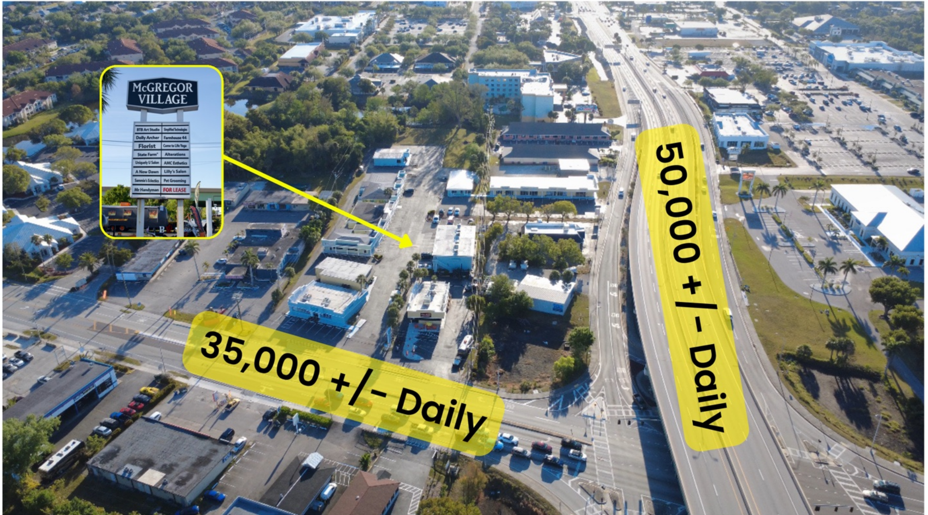
Traffic data sourced from AADT