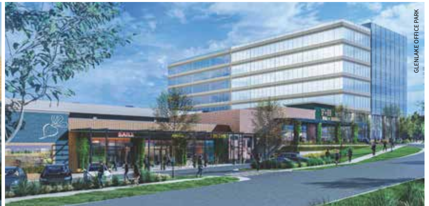
GLENLAKE OFFICE PARK