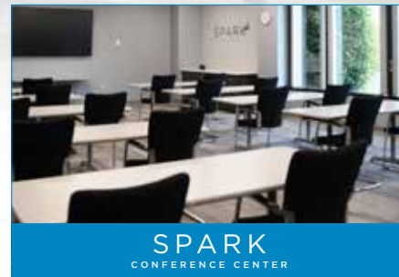
SPARK CONFERENCE CENTER