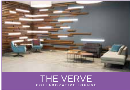
THE VERVE COLLABORATIVE LOUNGE