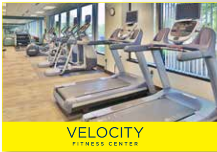
VELOCITY FITNESS CENTER