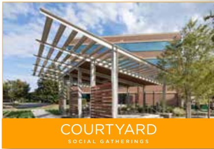
COURTYARD SOCIAL GATHERINGS