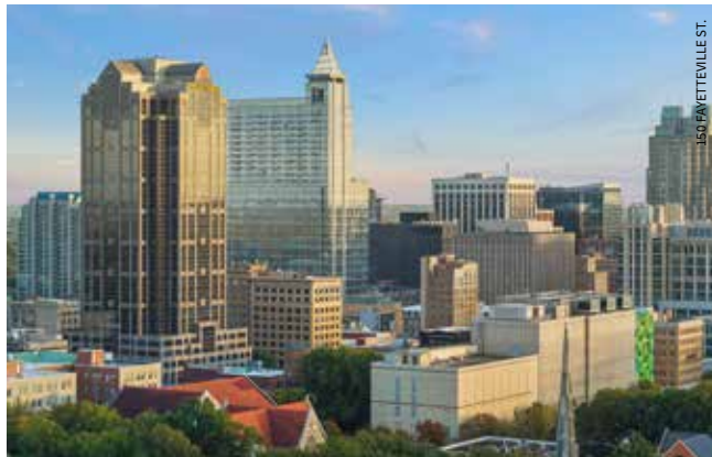
150 FAYETTEVILLE ST.