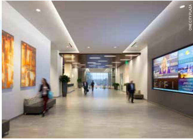
ONE CITY PLAZA