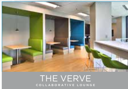
THE VERVE COLLABORATIVE LOUNGE