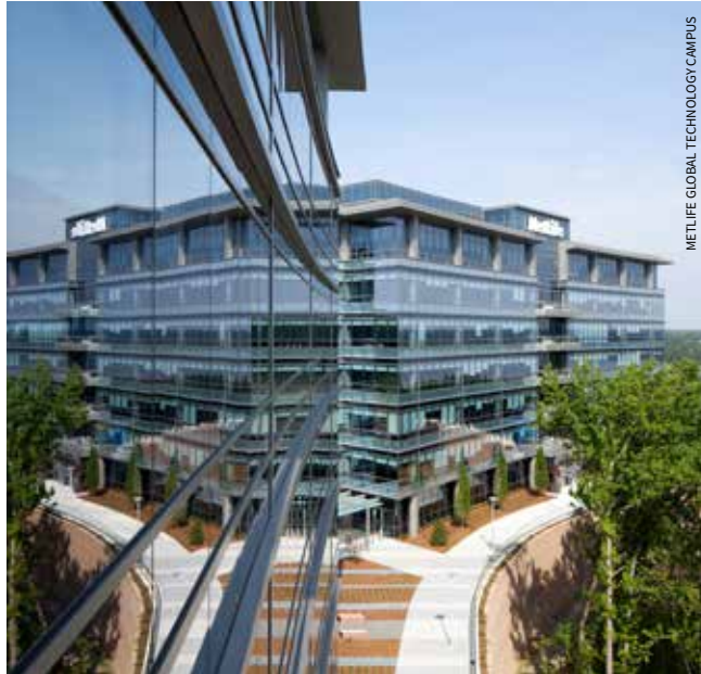
METLIFE GLOBAL TECHNOLOGY CAMPUS