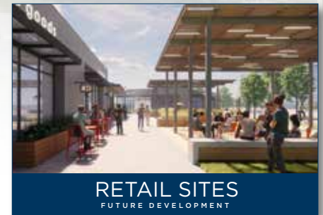
RETAIL SITES FUTURE DEVELOPMENT