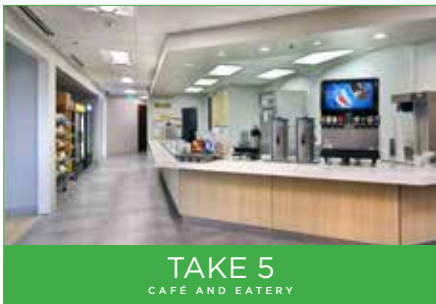
TAKE 5 CAFE AND EATERY