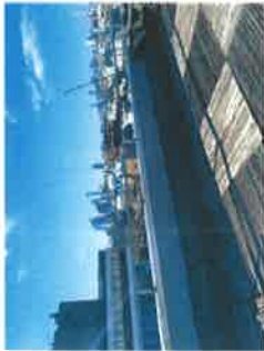
3256 STEINWAY REAR NYC CITY VIEWS