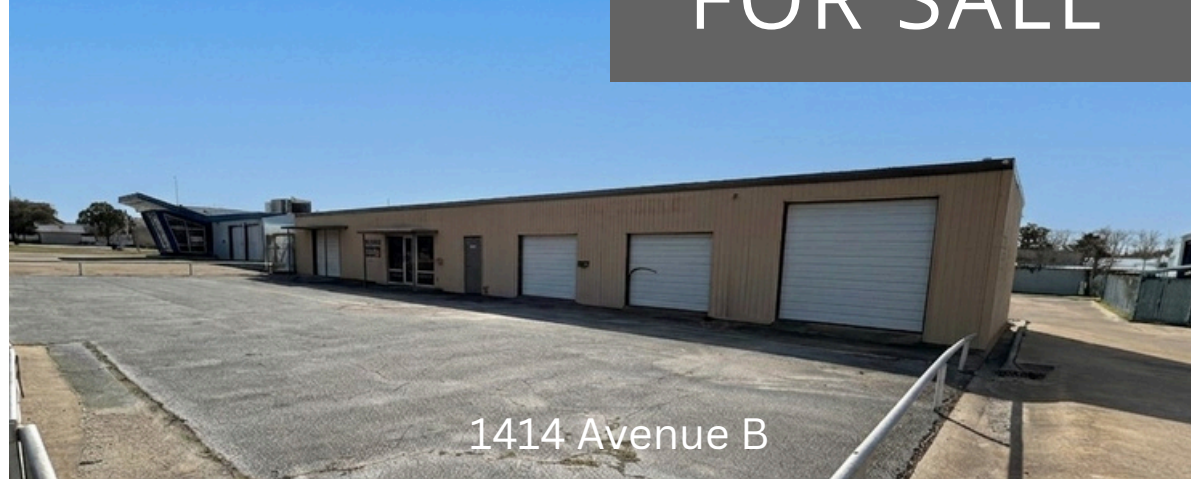
1414 Avenue B