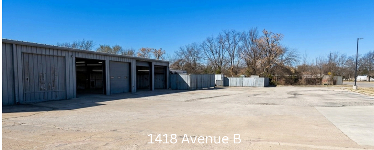
1418 Avenue B