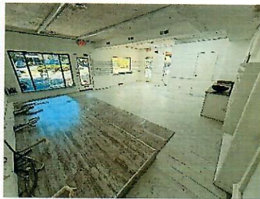
Previous Nail Salon, plumbing set up.