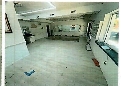
View from front door, laminate floors.

1 st Floor +/- 700 rentable square foot space. This space has been used for a nail salon for the past +/- 30 years and is ideal for all types of retail uses. This is a corner space facing both Auburn Ave. and Norfolk Ave. There is a retail box sign overtop the front entrance. Some of the interior improvements are a large open space, elevated platform with plumbing for previous pedicure stations, granite counter top with sink, ½ bathroom, room with stackable washing and driver and one small office. Available immediately. $4,500 per month, plus $400/month for CAM, plus utilities.