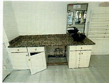
Granite Counter with Sink.