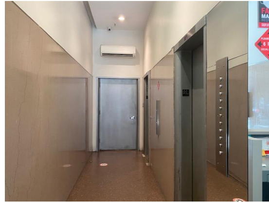
Bldg Lobby Elevator bank