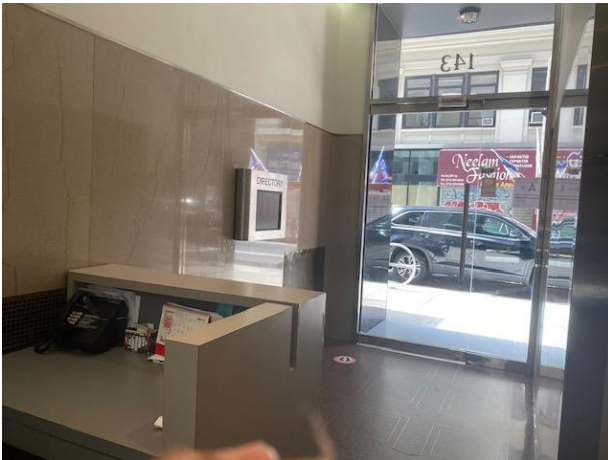
Building Lobby Concierge desk