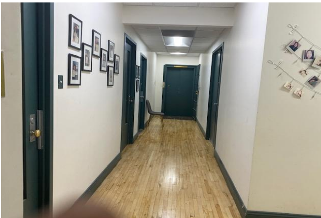
11 th Floor hallway