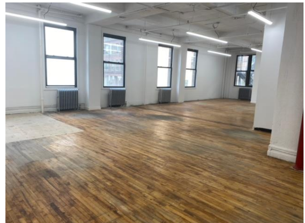
#1101 under renovation

Berik Management is excited to bring to market the ENTIRE 11 TH FLOOR at 143 West 29 th Street, New York, NY 10001.