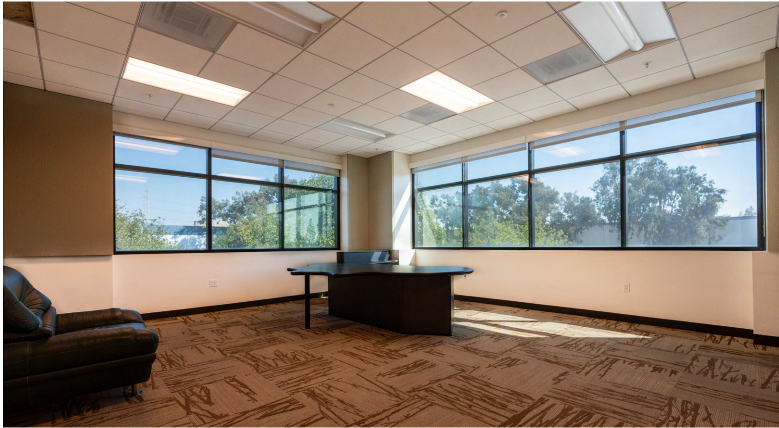
Glass Banded Office