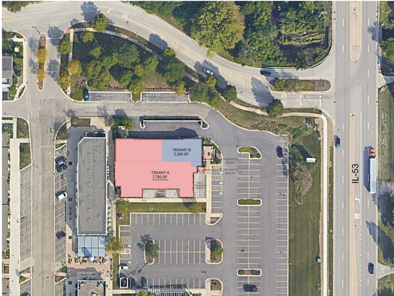
SITE PLAN OPTION 2 1" = 40'-0"

SEVEN BRIDGES BUILDING REDEVELOPMENT 6310 IL-53 WOODRIDGE, IL 60517 6/18/2024 PROJECT NUMBER | 924054