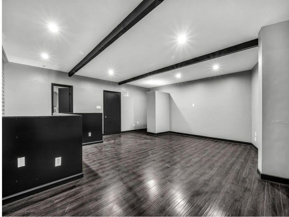
5727 W Adams 10