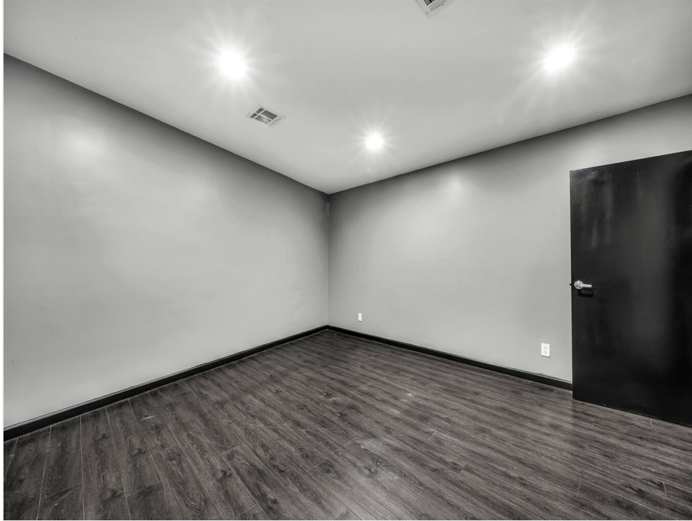
5727 W Adams 7