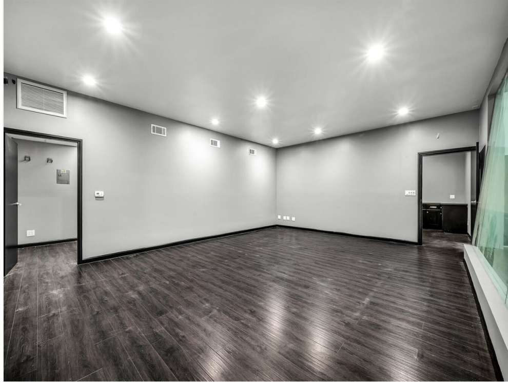
5727 W Adams 6