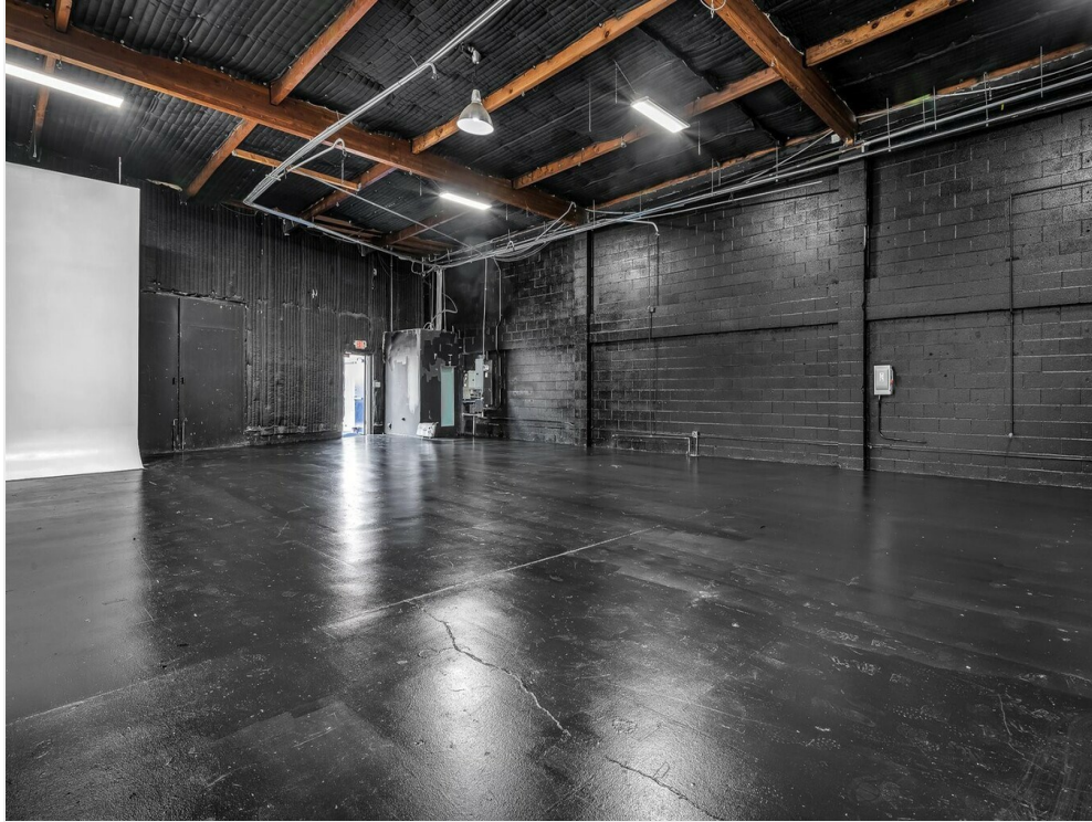
5727 W Adams 4