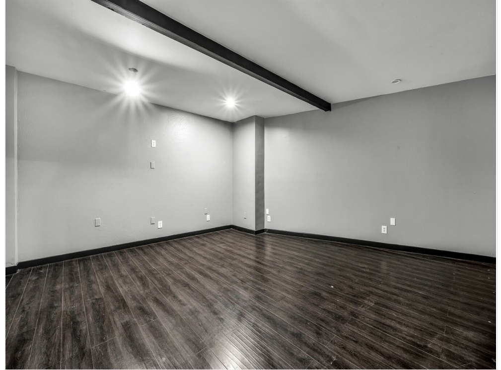
5727 W Adams 11