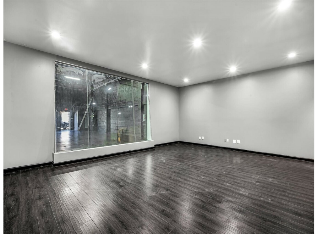
5727 W Adams 5