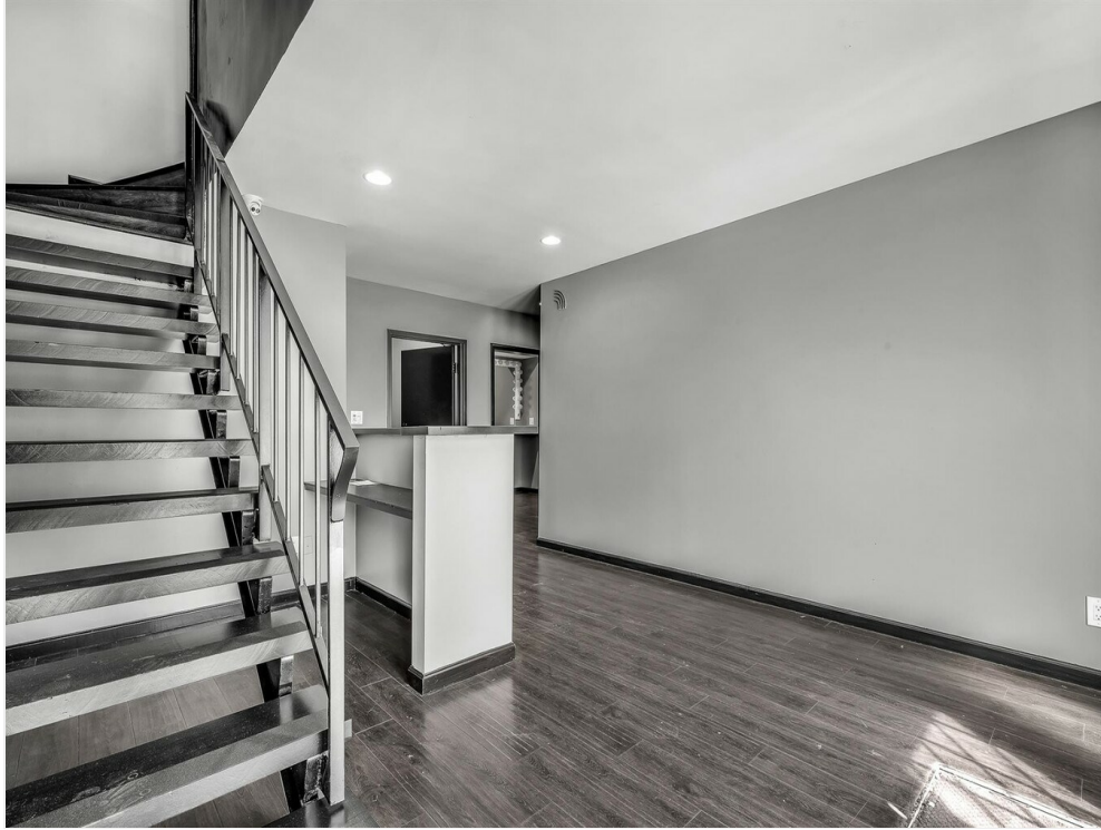
5727 W Adams 18