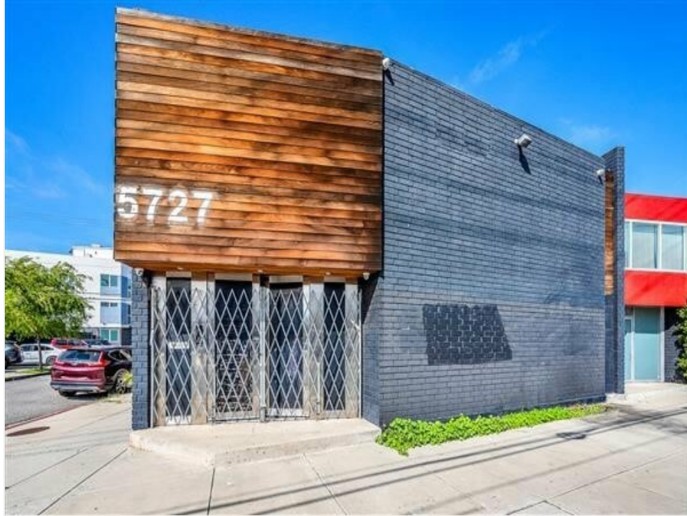
5727 W Adams 1