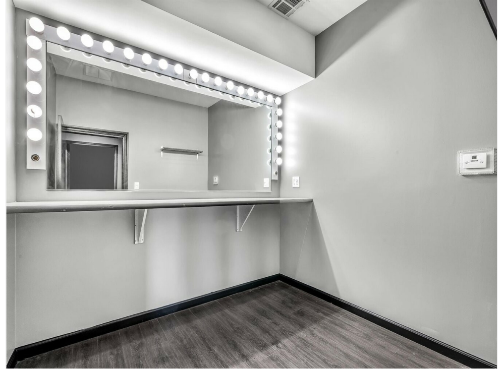
5727 W Adams 7