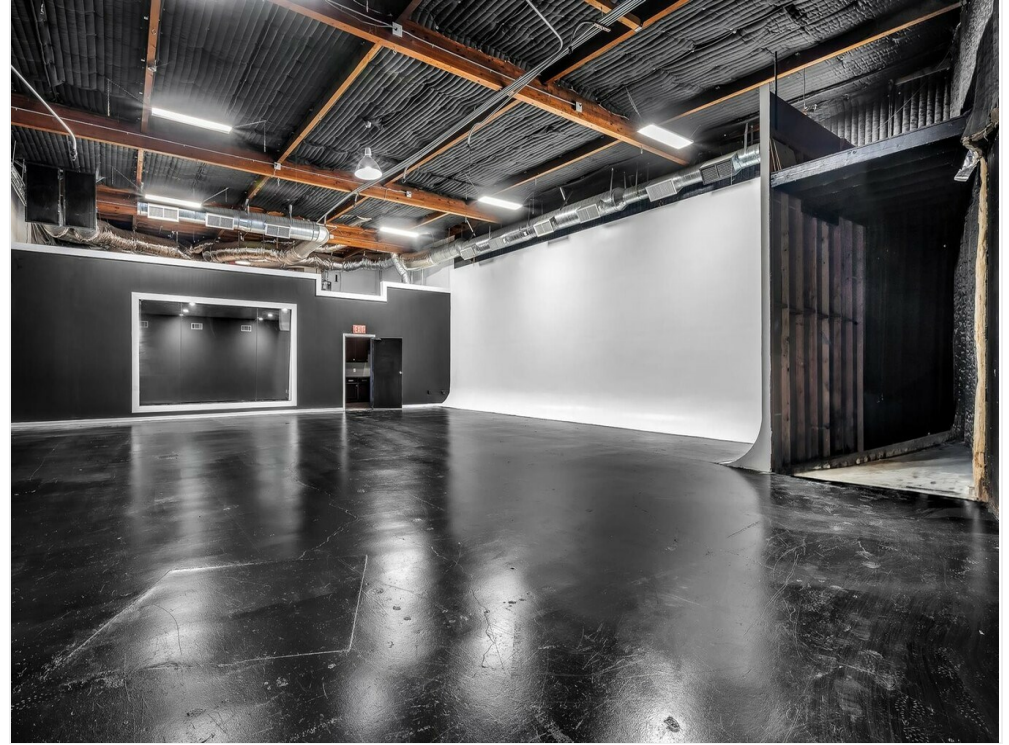
5727 W Adams 20