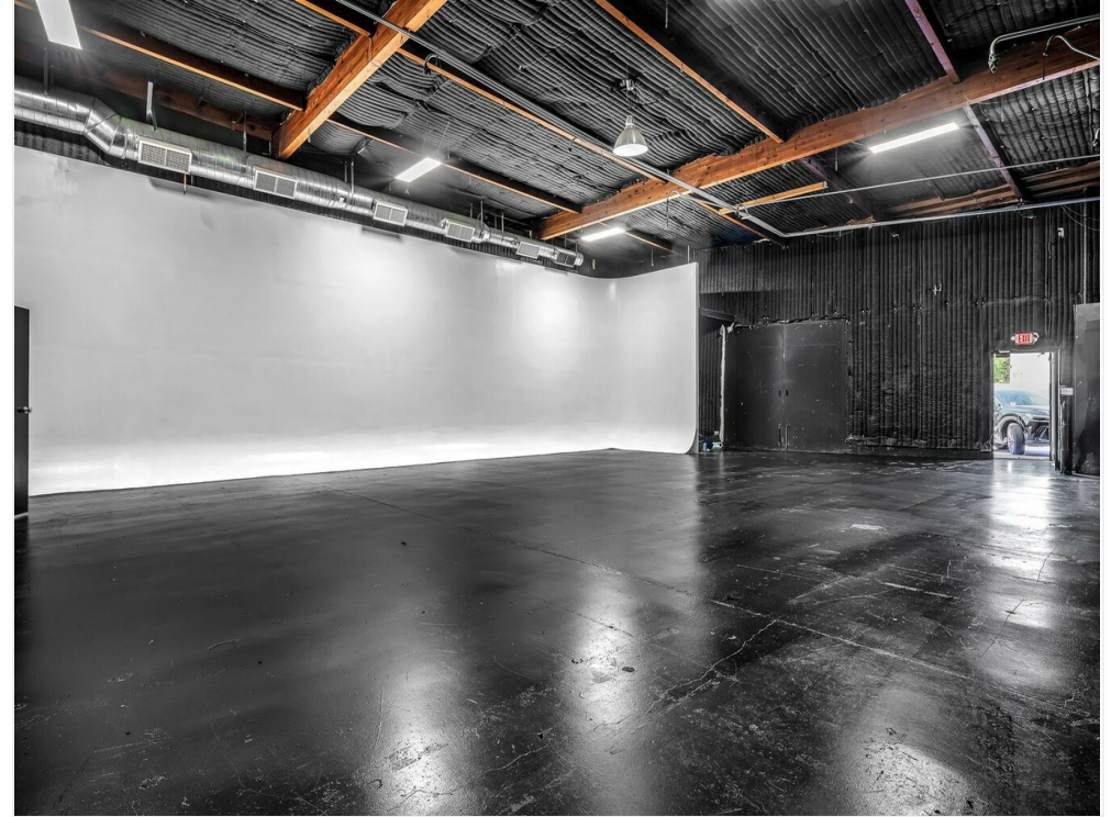
5727 W Adams 3