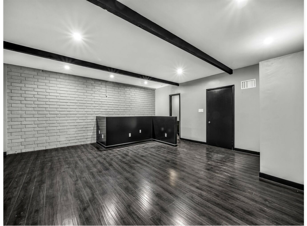
5727 W Adams 9