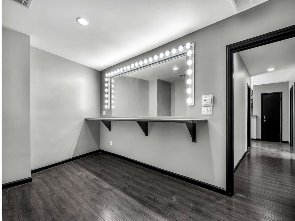
5727 W Adams 8