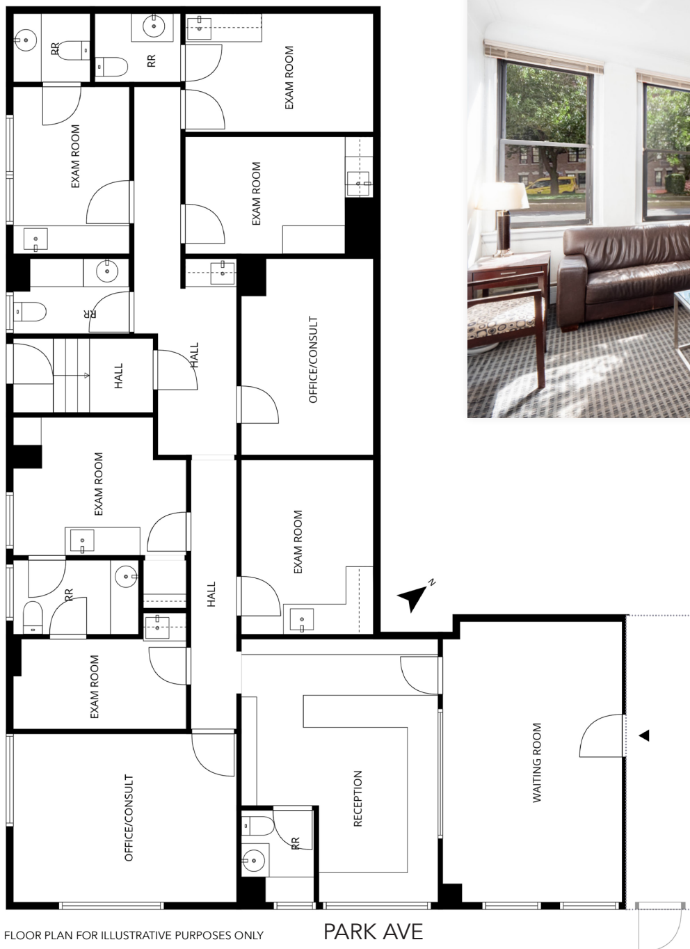
FLOOR PLAN FOR ILLUSTRATIVE PURPOSES ONLY