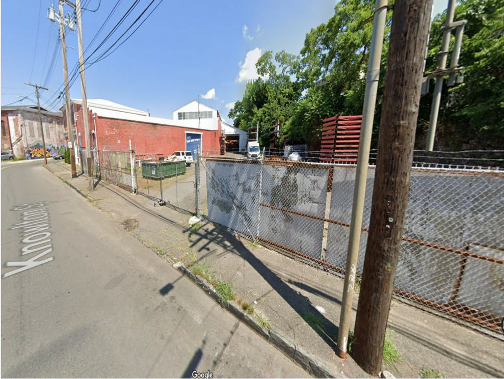
72 Knowlton St