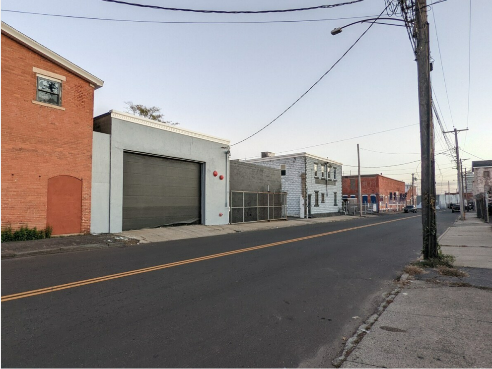
116 Front 2