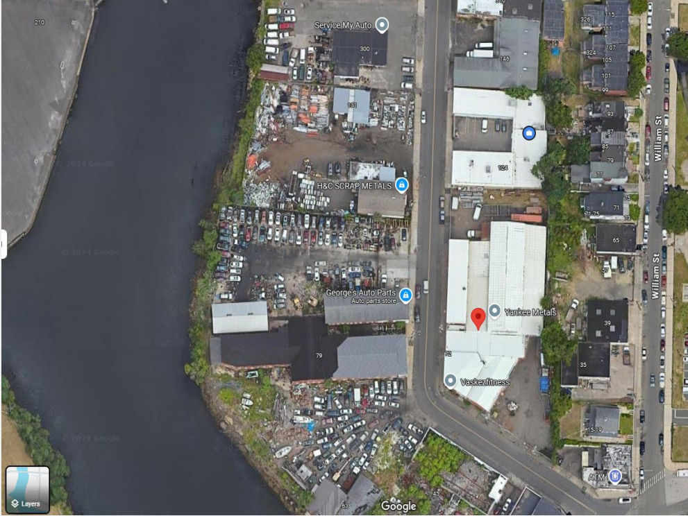
72-116 Knowlton St