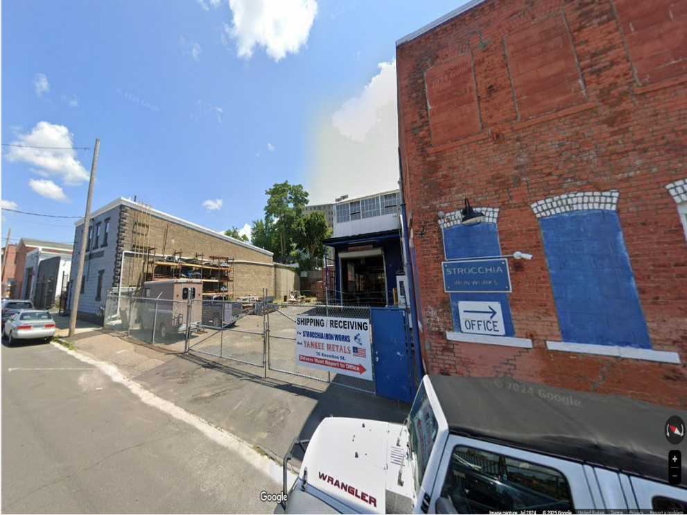
72-116 Knowlton St