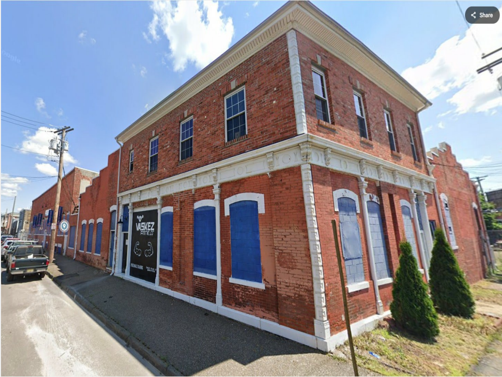
72 Knowlton St