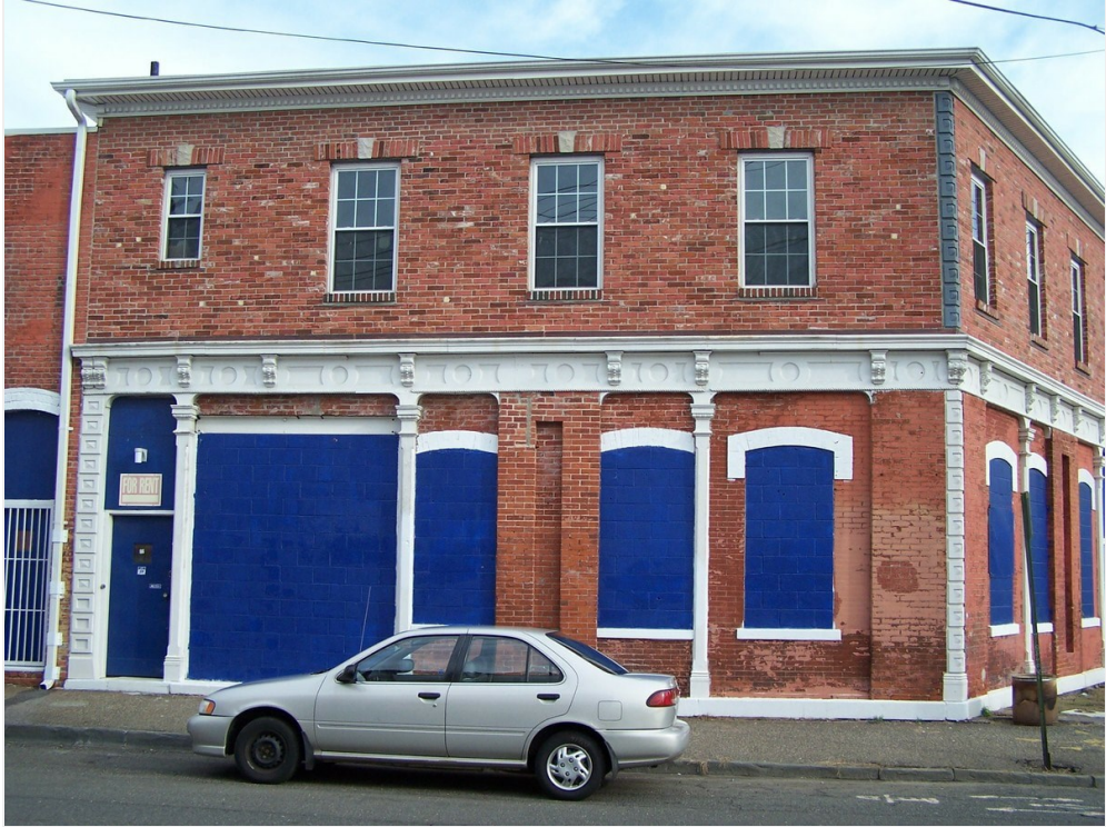
72 Knowlton St