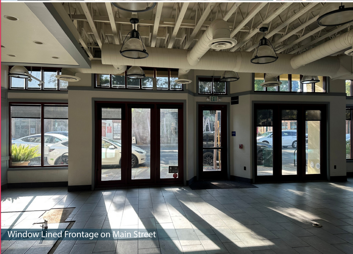
Window Lined Frontage on Main Street