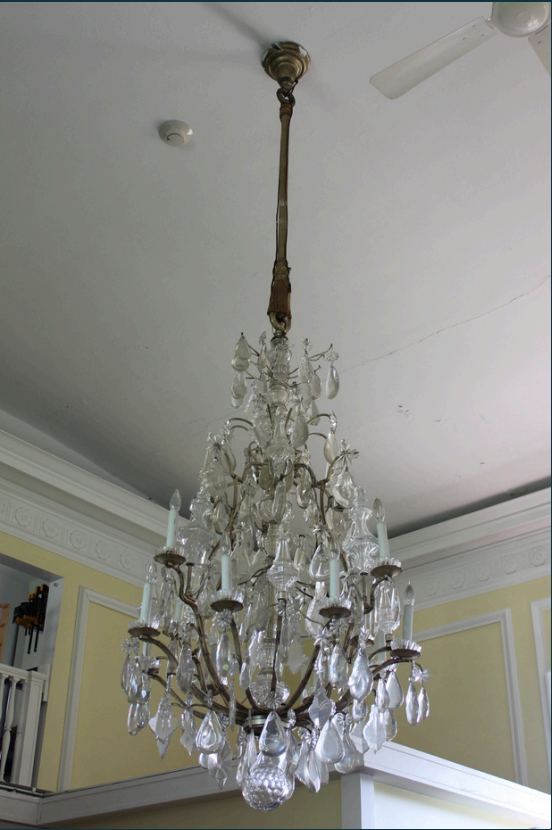
Crystal chandelier in Roberts Hall