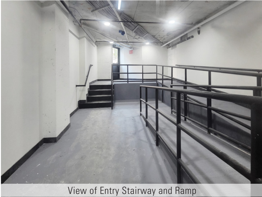
View of Entry Stairway and Ramp