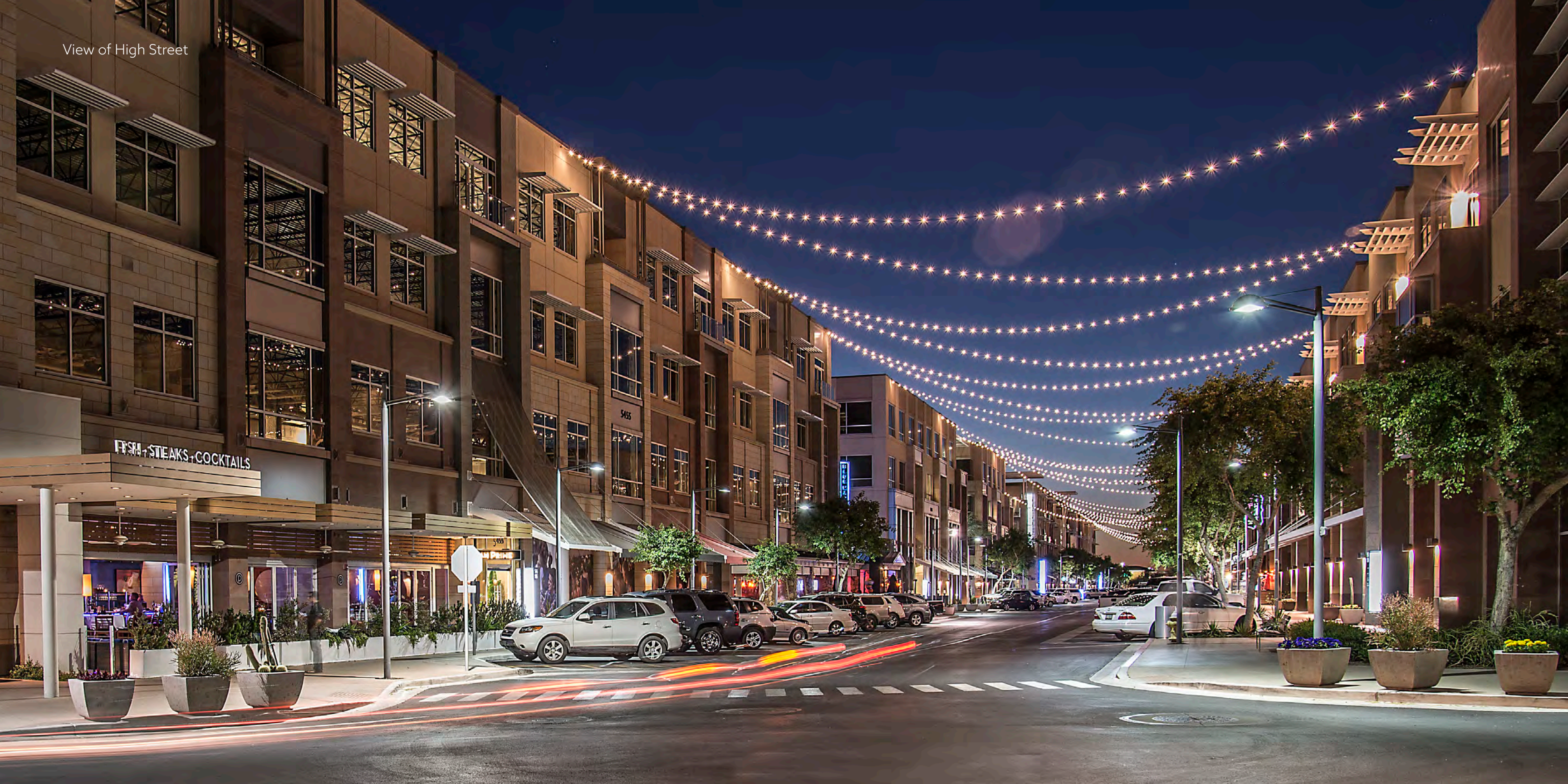
View of High Street