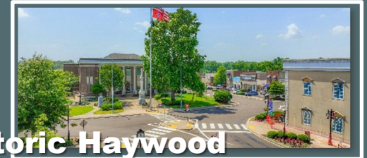
Historic Haywood County Courthouse