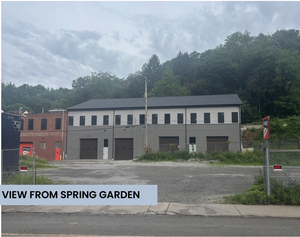
VIEW FROM SPRING GARDEN