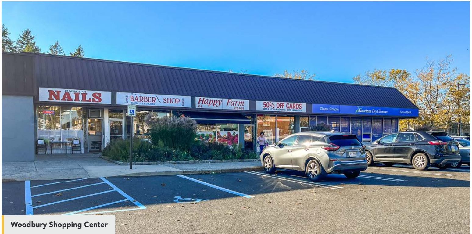
Woodbury Shopping Center

+/- 30,000 SF For Lease at Woodbury Shopping Center