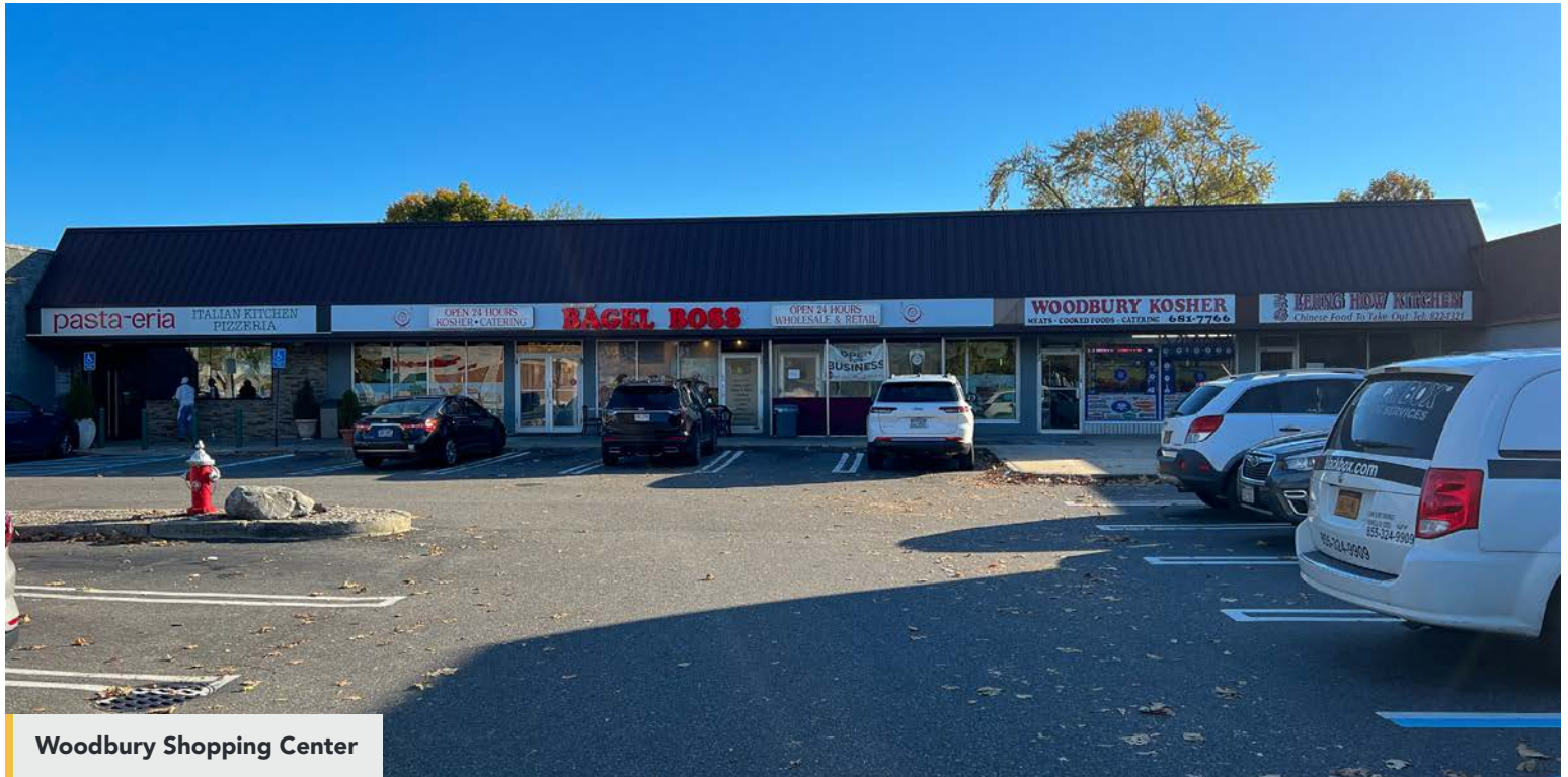
Woodbury Shopping Center

+/- 30,000 SF For Lease at Woodbury Shopping Center