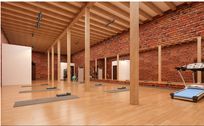
Fitness Studio Concept

Ideal Uses: Fitness Studio, Hardware Store, Auto-Parts, Barbershop, Office Space, Pharmacy, Medical Office (Dentist, Doctor, etc.), Boutique