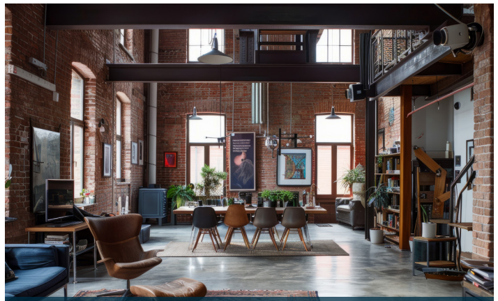
Office/Creative Space Concept