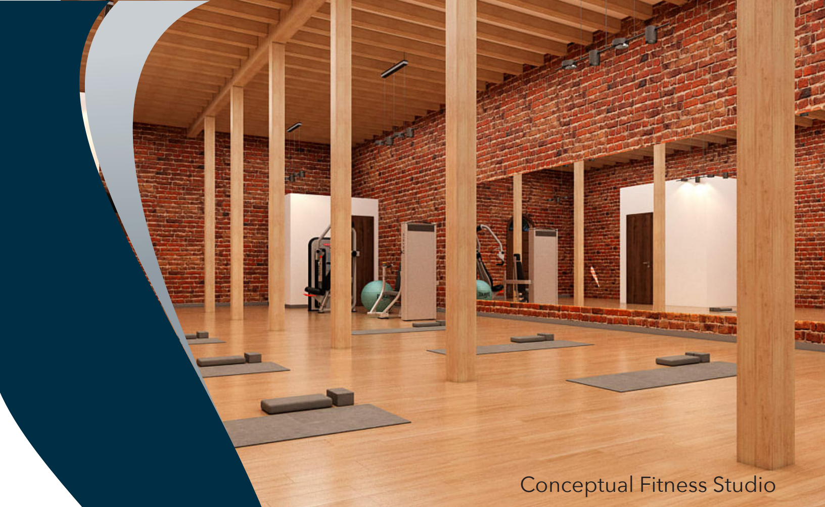
Conceptual Fitness Studio