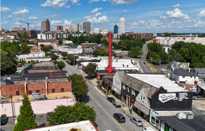
Birds Eye East