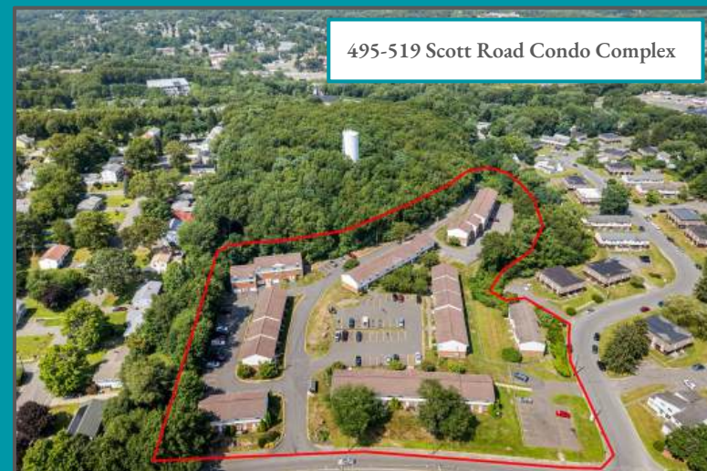
495-519 Scott Road Condo Complex