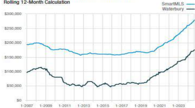
Median Sales Price - Townhouse/Condo Rolling 12-Month Calculation

Total Condo Units For Sale: Thirty Seven (37) Total Leasable Square Footage: 36,801 SQFT