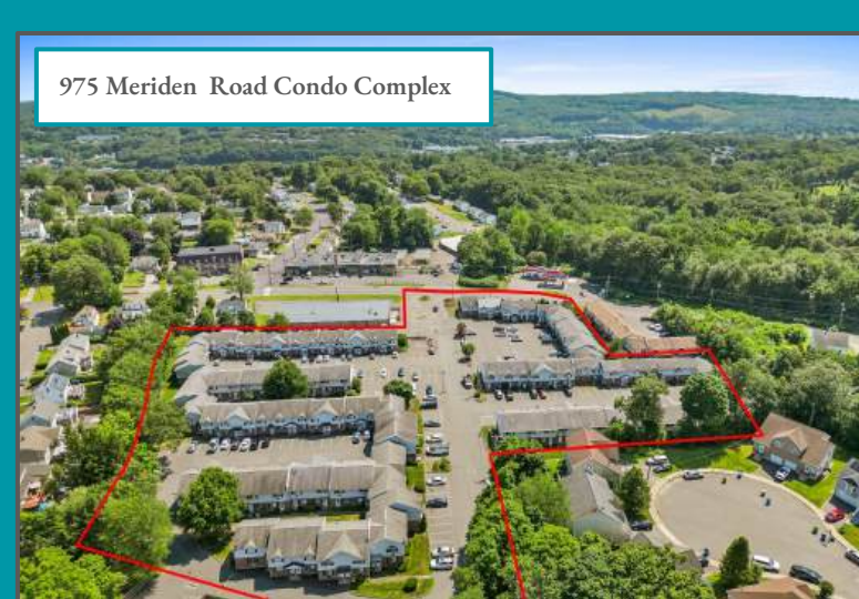
975 Meriden Road Condo Complex