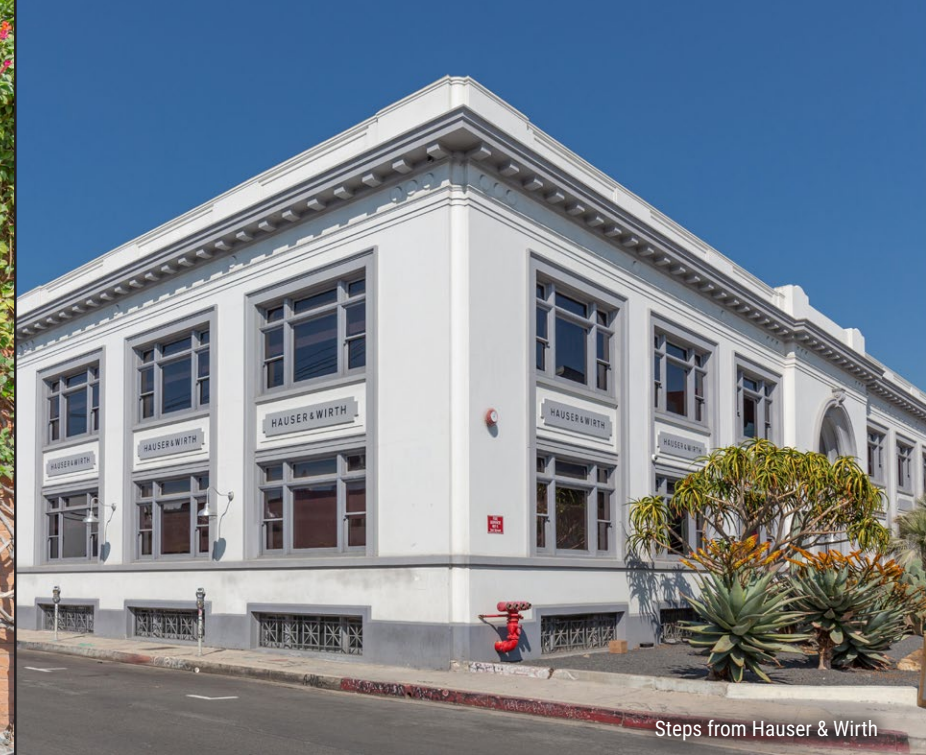
Steps from Hauser & Wirth