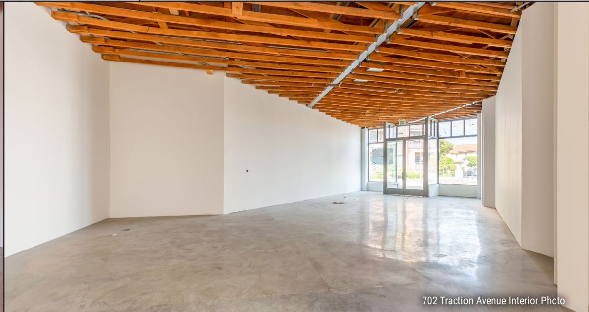
702 Traction Avenue Interior Photo