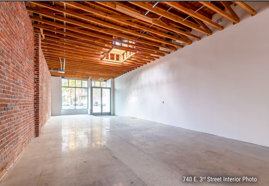
740 E. 3 rd Street Interior Photo