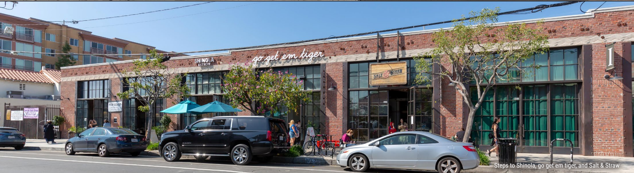
Steps to Shinola, go get em tiger, and Salt & Straw