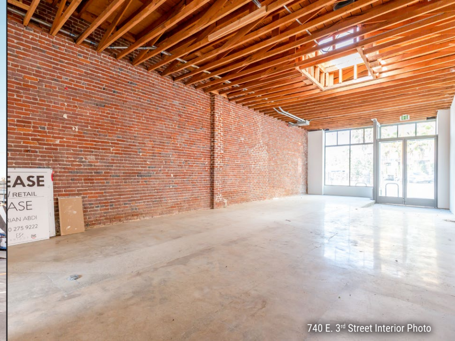
740 E. 3 rd Street Interior Photo