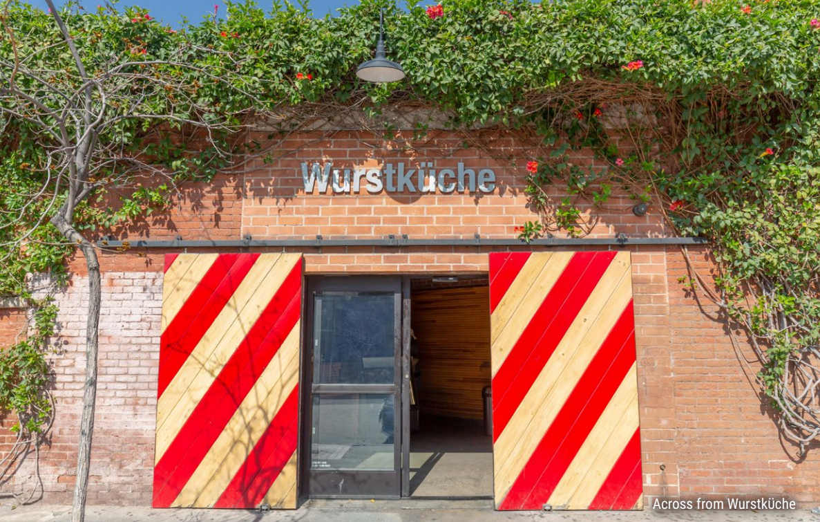
Across from Wurstküche