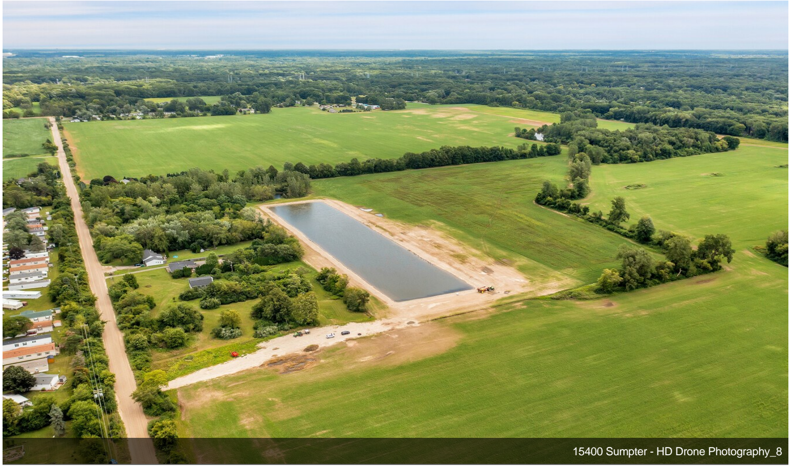
15400 Sumpter - HD Drone Photography_8