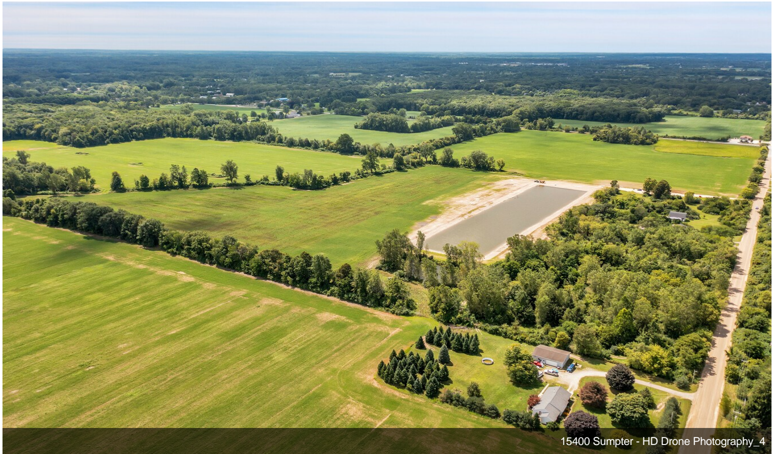
15400 Sumpter - HD Drone Photography_4