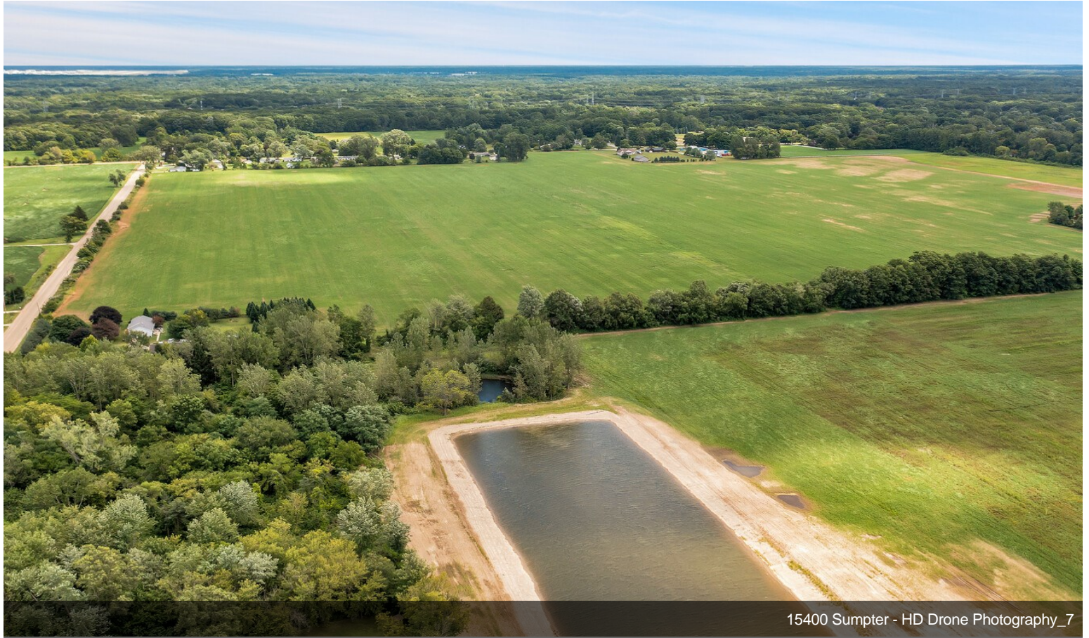
15400 Sumpter - HD Drone Photography_7