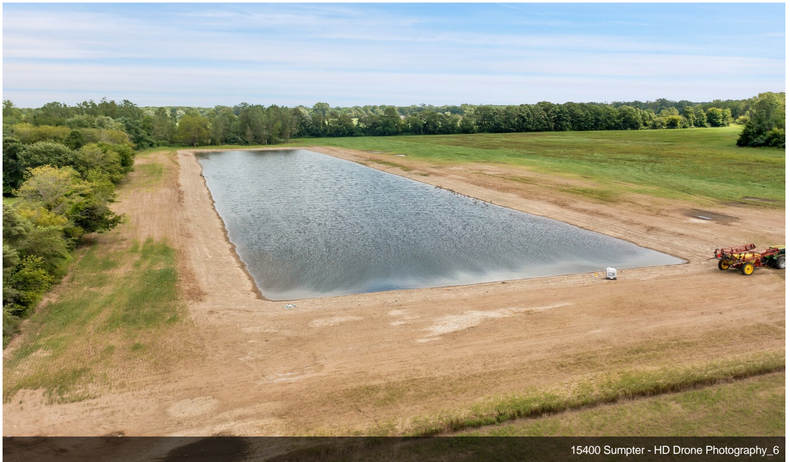
15400 Sumpter - HD Drone Photography_6