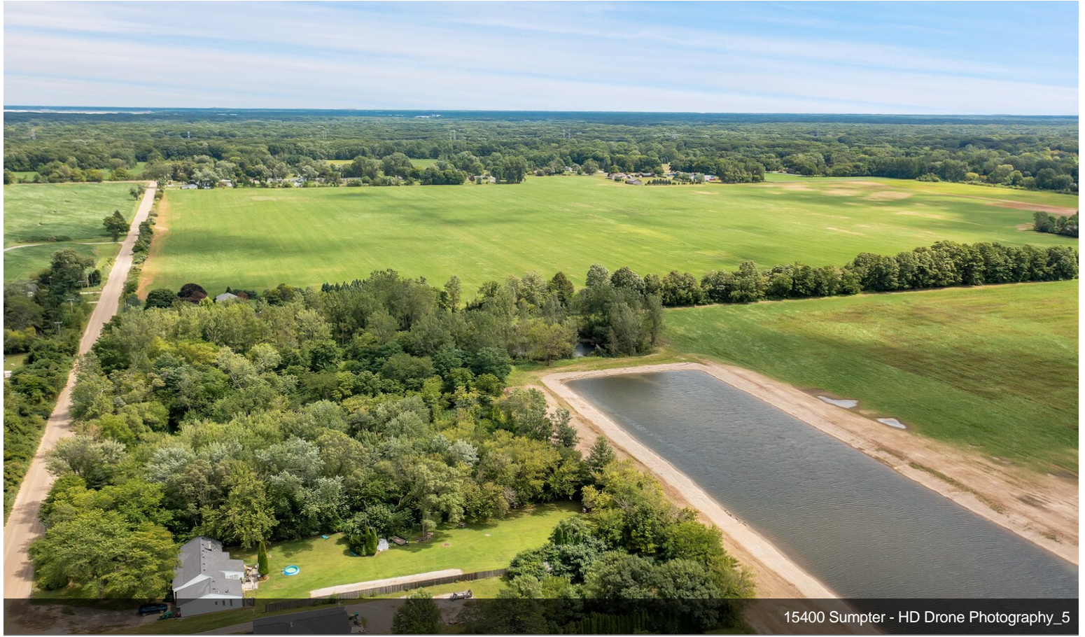
15400 Sumpter - HD Drone Photography_5