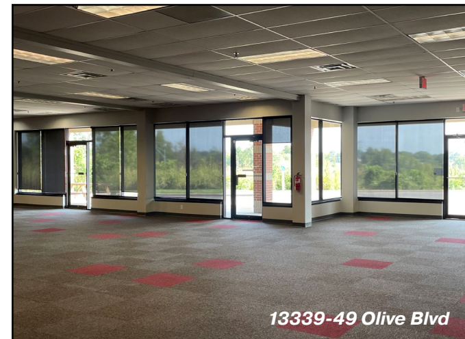
13339-49 Olive Blvd