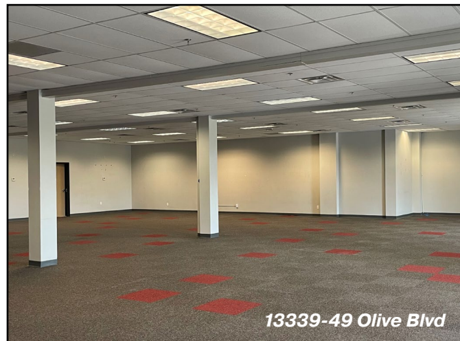
13339-49 Olive Blvd