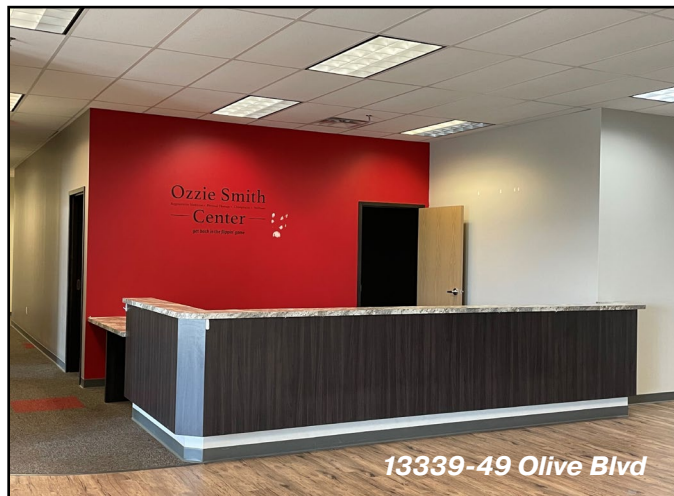
13339-49 Olive Blvd