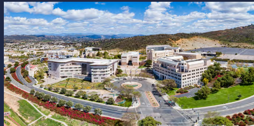
California State University, San Marcos