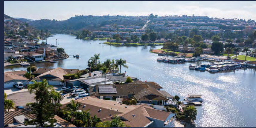
Lake San Marcos