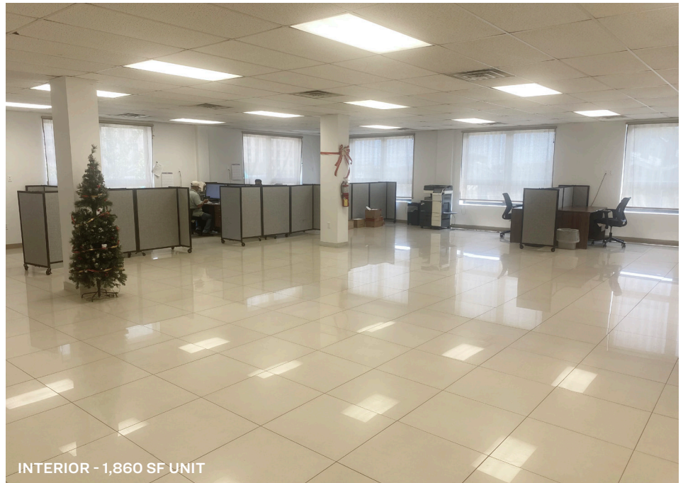
INTERIOR - 1,860 SF UNIT