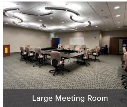
Large Meeting Room