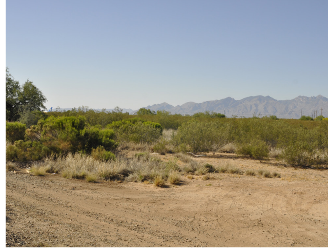
Property View N.W.