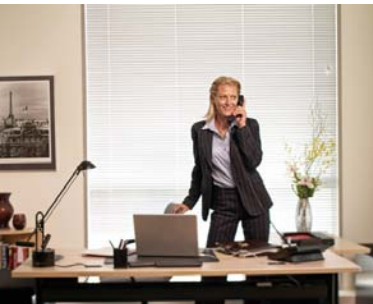
Fully equipped offices On-Demand.