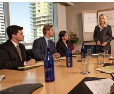
Meeting rooms that fit your needs.