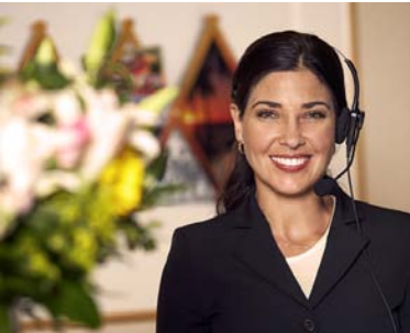
A receptionist to greet your visitors.