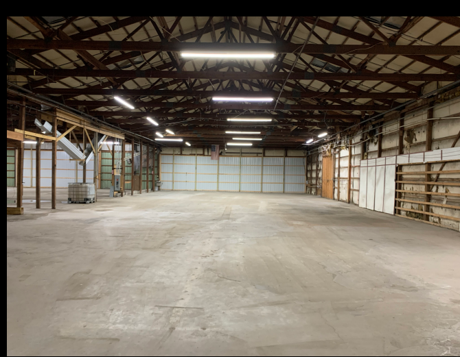
RCH Properties is proud to have the opportunity to present 87,000 Square Feet of Warehouse in Gallatin Tennessee.

The property is in the middle of Gallatin and has easy access to the new Hatton Track Extension for direct paths to Portland, I65N, Nashville, I65S, including great access to Hwy 109S to I40 and Lebanon TN.