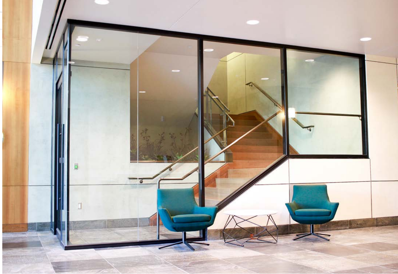
Newly Renovated Lobby Provides Sleek and Modern Welcome