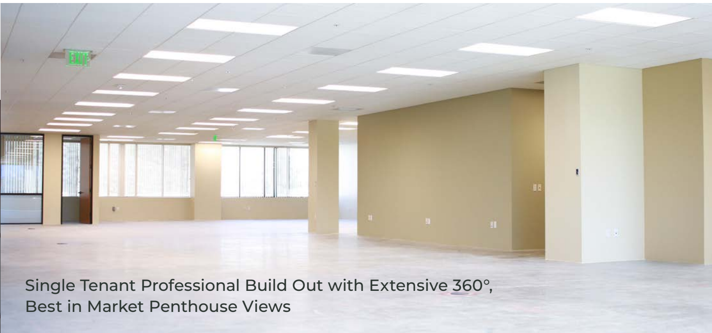
Single Tenant Professional Build Out with Extensive 360°, Best in Market Penthouse Views