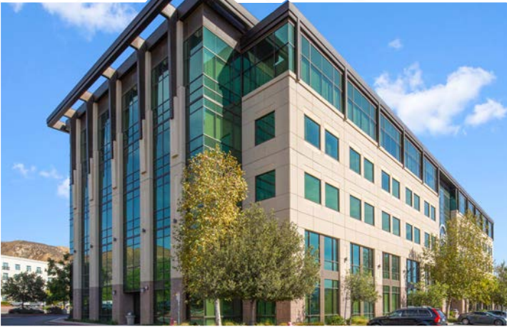
2008 Steel-Frame Construction