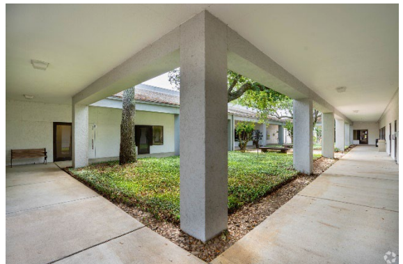
1600 Atrium Entrance Walk