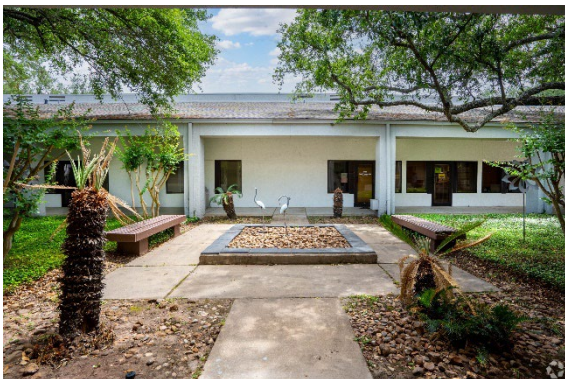
Atrium Garden Area