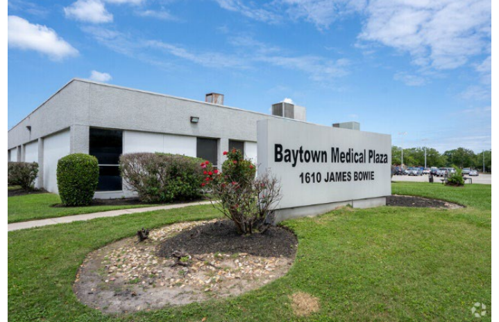
1610 Monument Signage