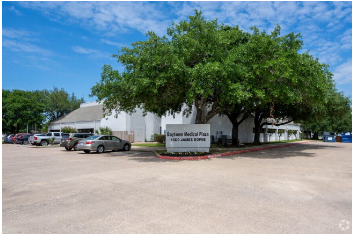
1600 Lot View Entrance