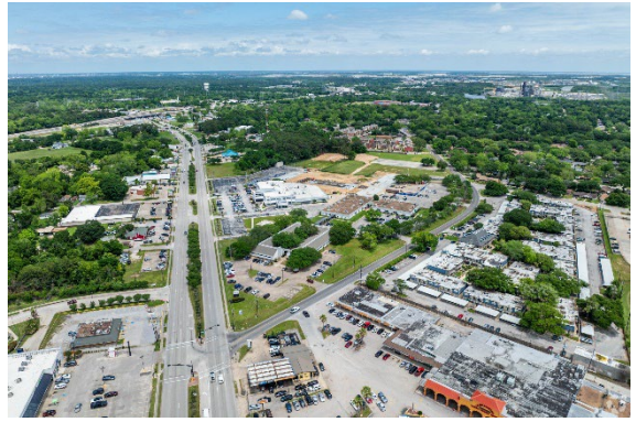
Birds Eye View