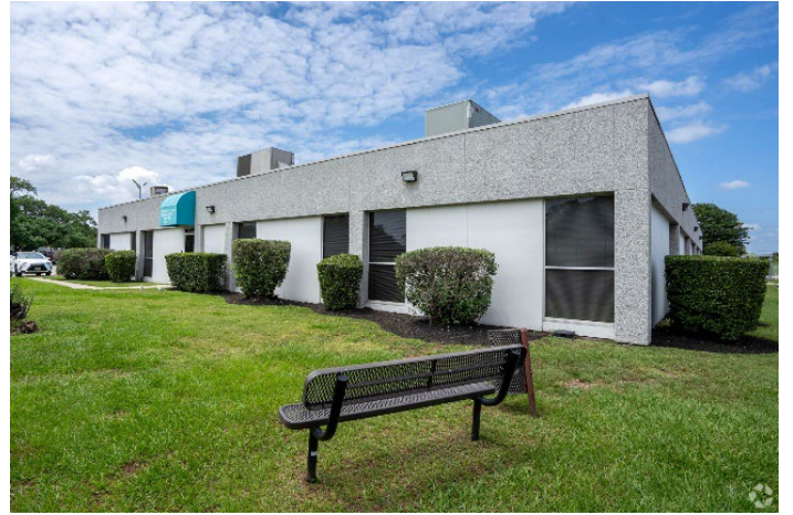
1610 Side View