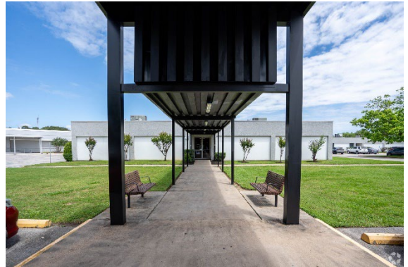
1600 - 1610 Connecting Canopied Walkway