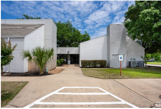
1600 Entrance walkway