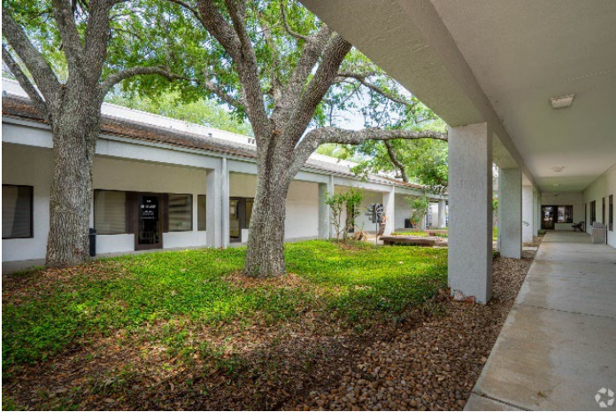
1600 Atrium Walkway