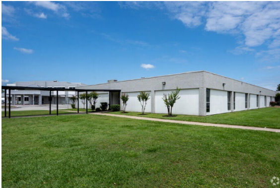
1610 Side Entrance