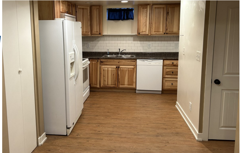
LOWER LEVEL APARTMENT KITCHEN