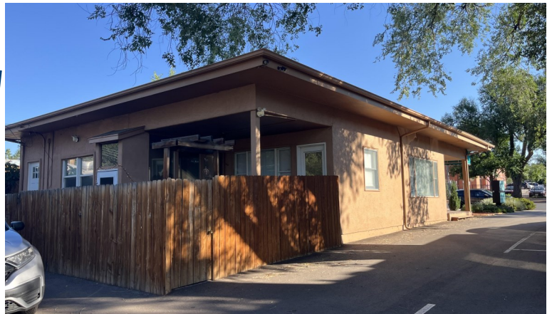
SIDE / BACK