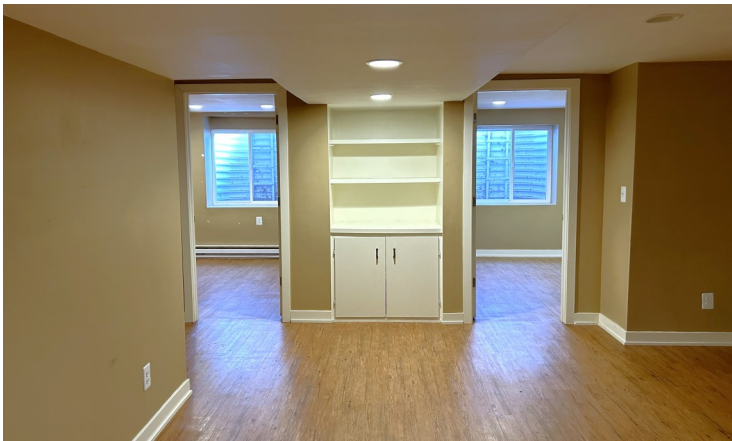
LOWER LEVEL APARTMENT