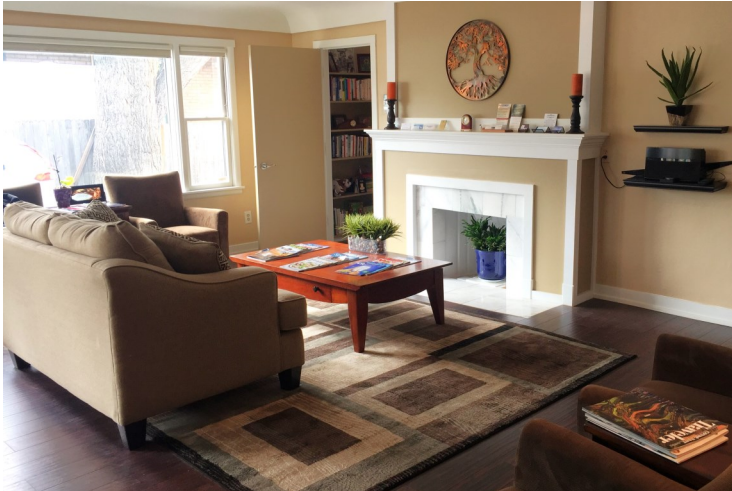
RECEPTION / WAITING ROOM