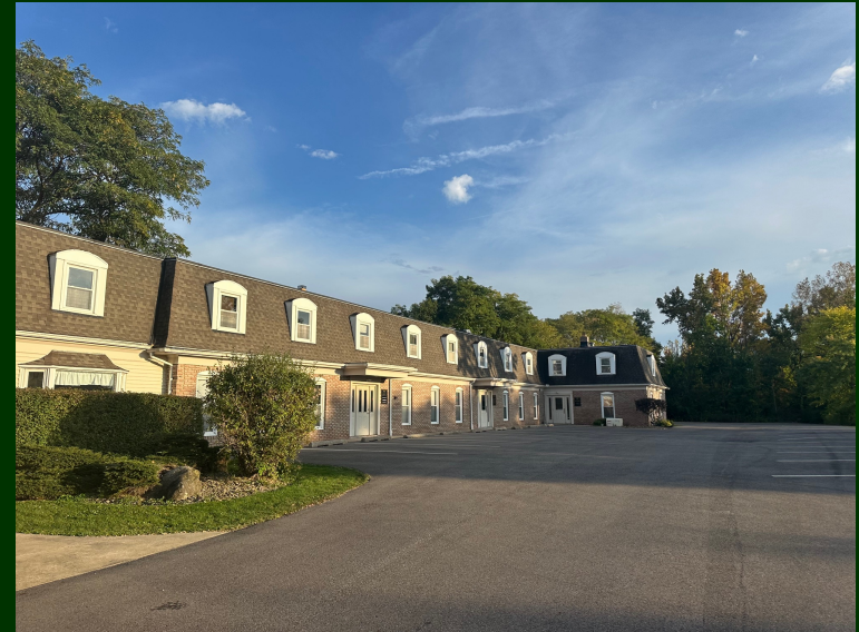
8437 Mayfield Rd., Chesterland, OH 44026

No warranty or representation, express or implied, is made as to the accuracy of the information contained herein. It is submitted subject to errors, omissions, price changes, rental or other conditions, withdrawal without notice, and to any special listing conditions imposed by our client.