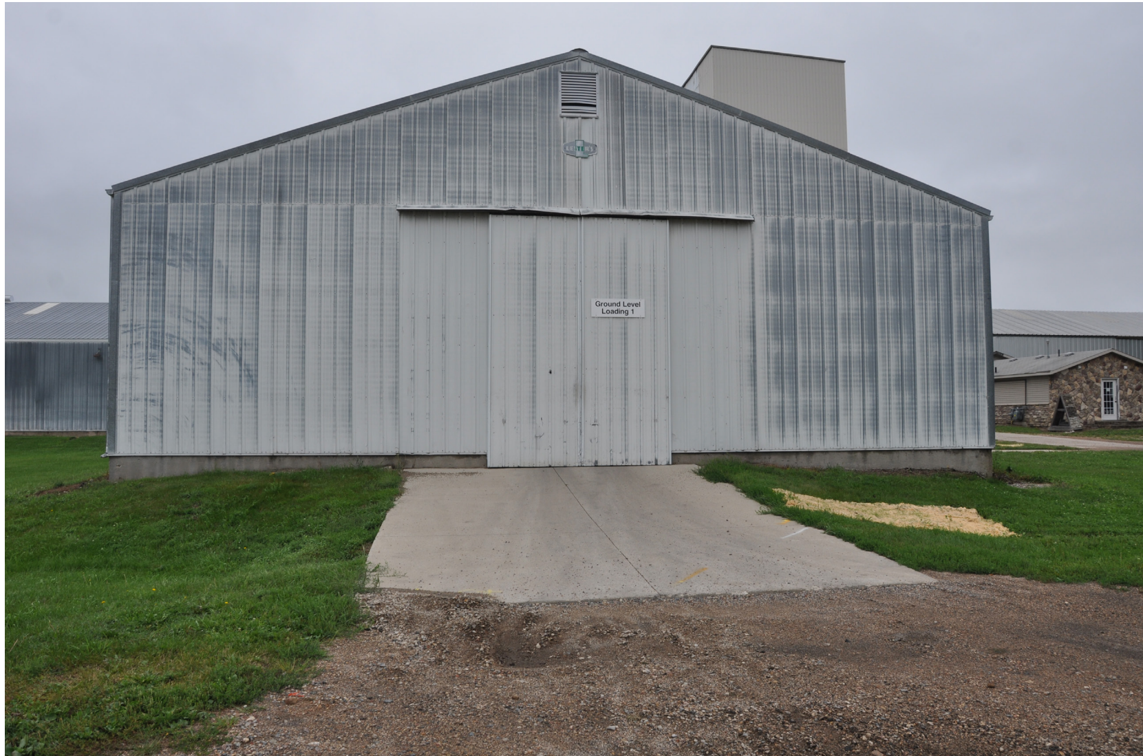
Drive-In Door Available Thru Main Building

This information has been secured from sources we believe to be reliable, but we make no representations or warranties explained or implied as to the accuracy of the information. Buyer must verify the information and bears all risk for any inaccuracies.