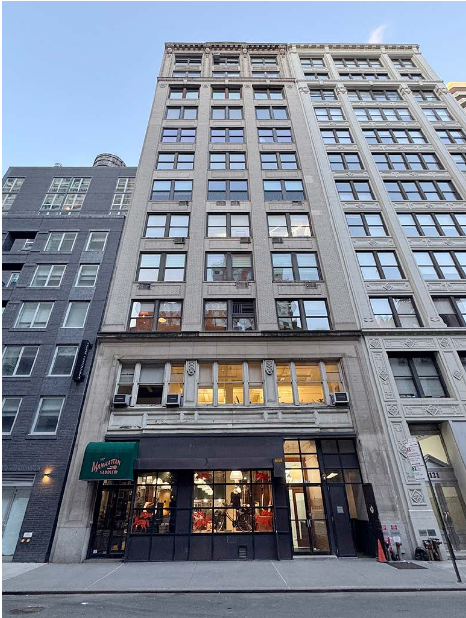
117 East 24 th Street, New York, NY 10010