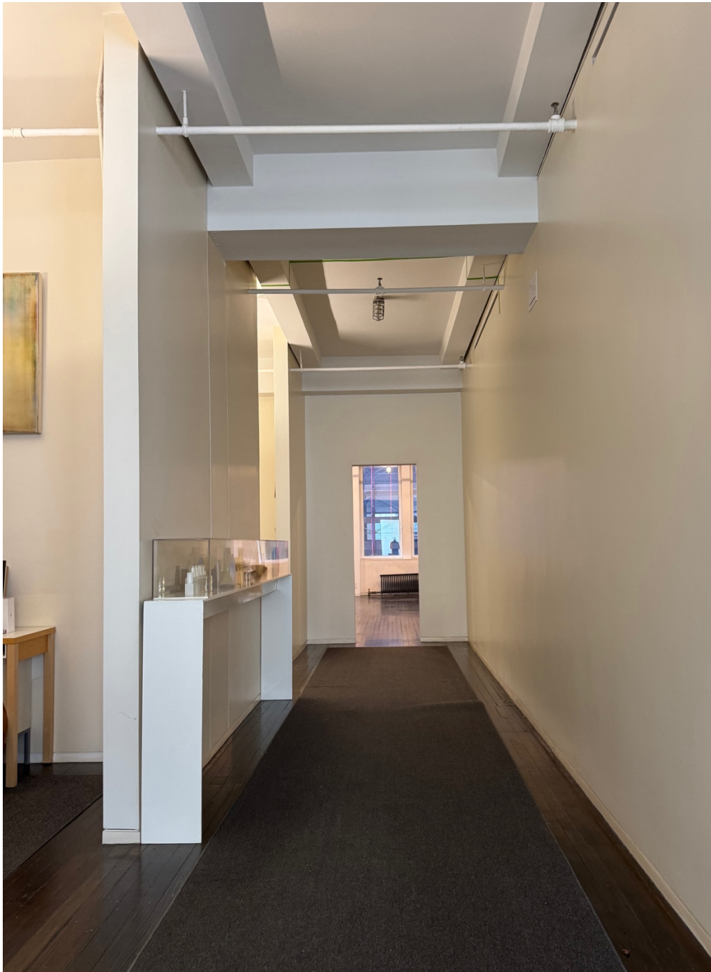
Hallway + offices