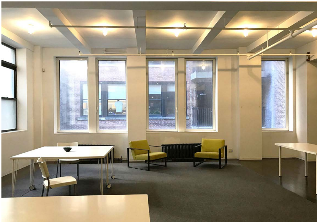
Open space 2 - East