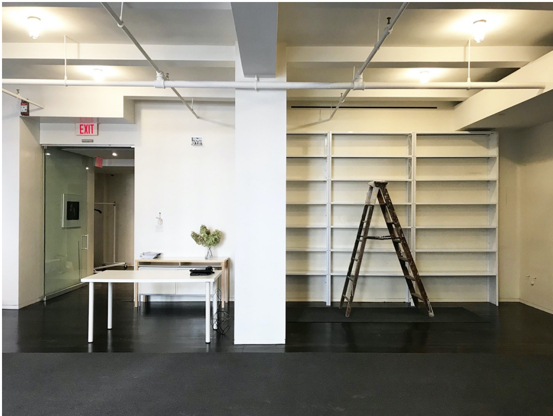
Open space 2 – South