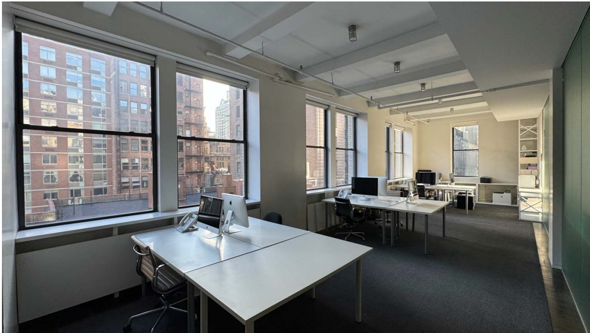
Open space 1 - South