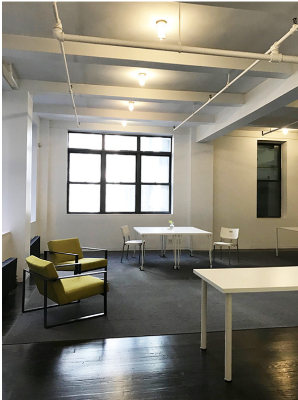
Open space 2 - West