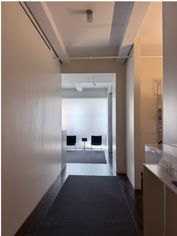
Hallway + offices