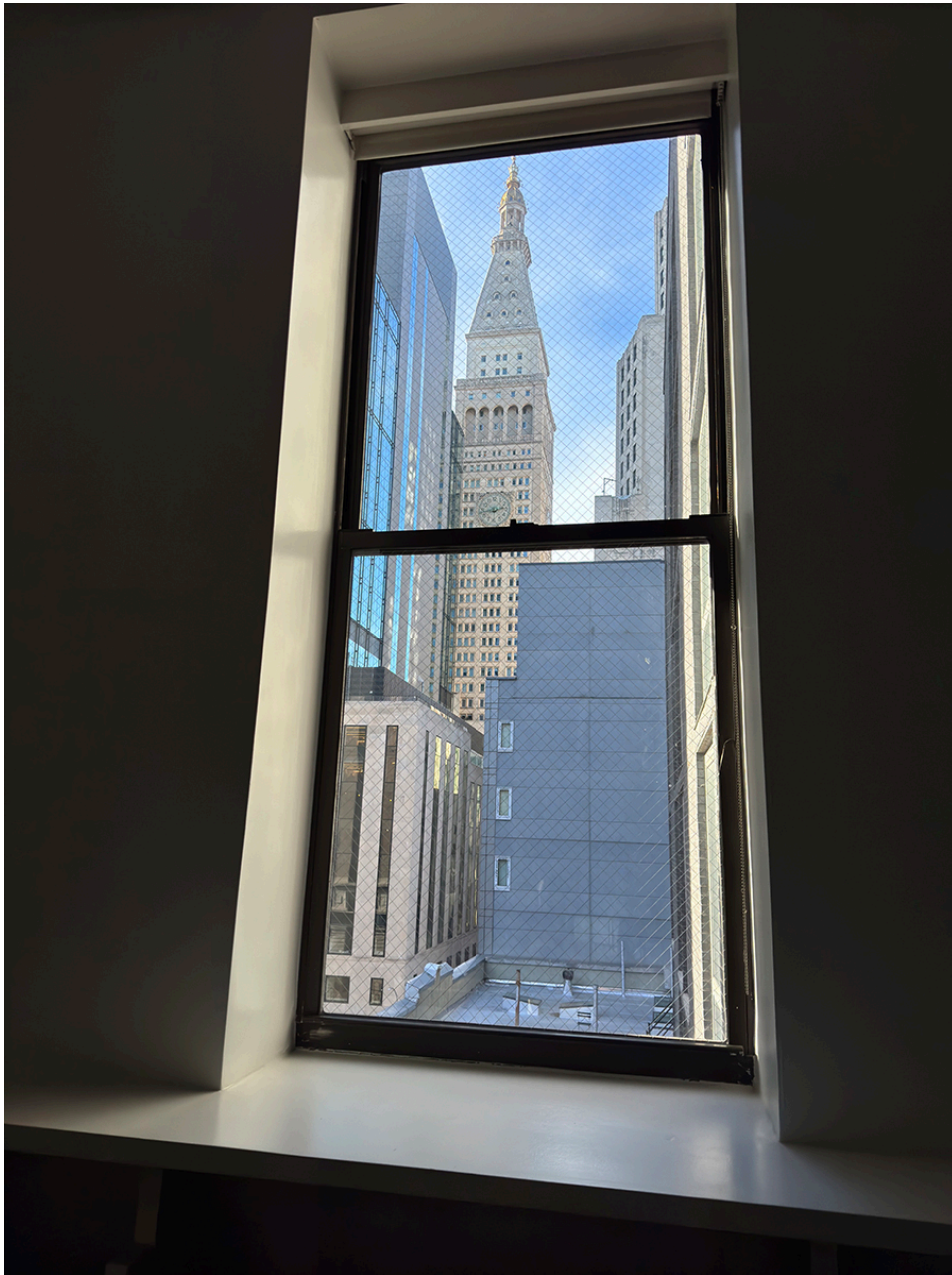
View from meeting room