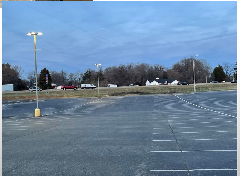
View of I-40 From Front of Suite