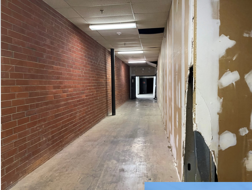
Hallway between main area and additional rooms