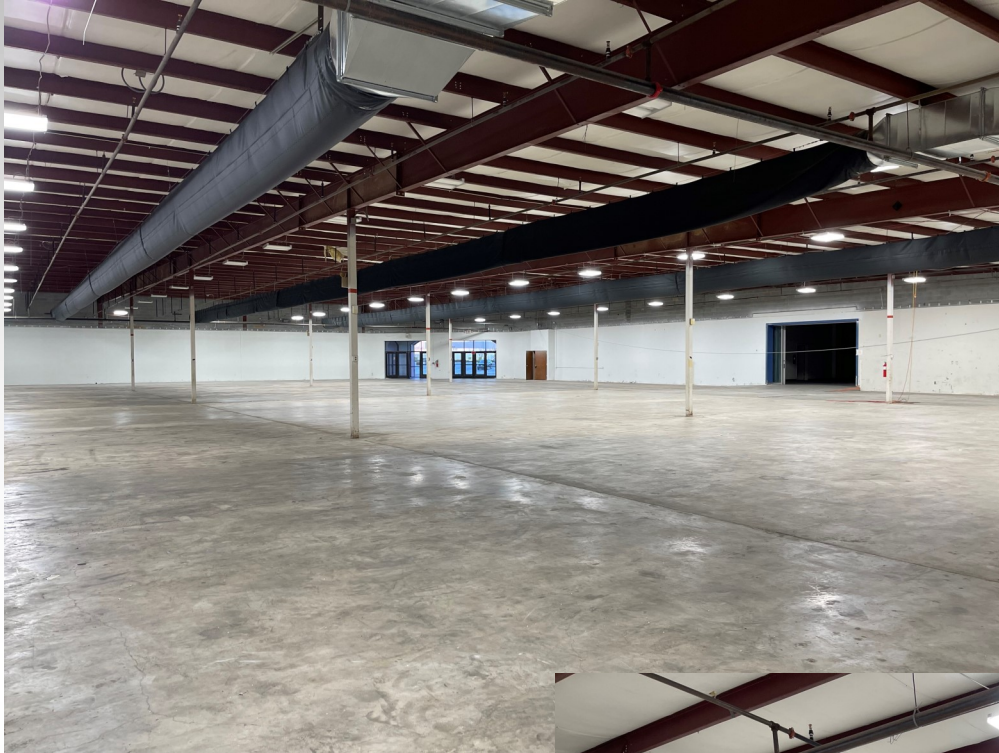
Large Open Space, Tall Ceilings