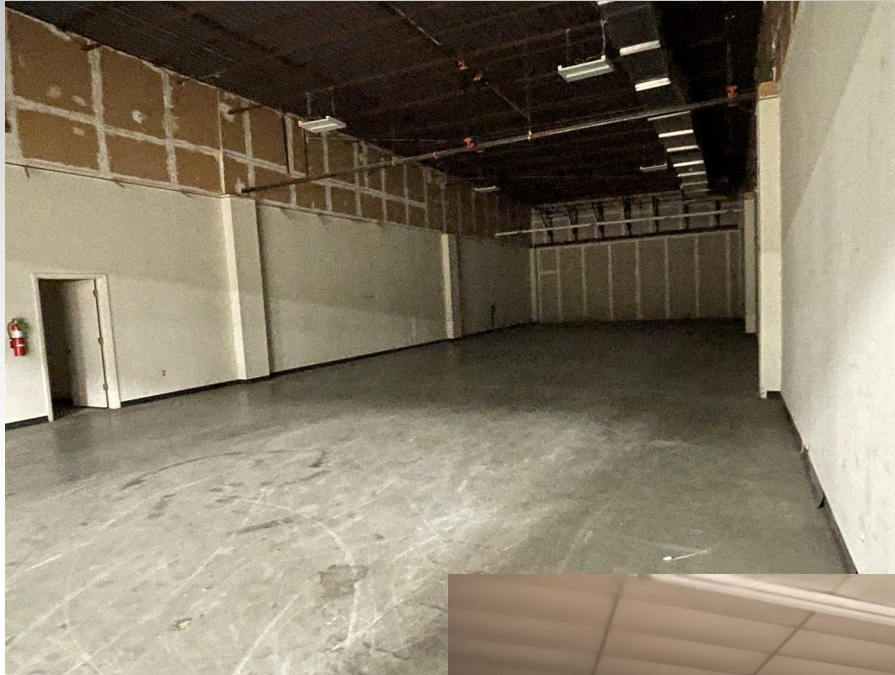
2nd View of Side Attached