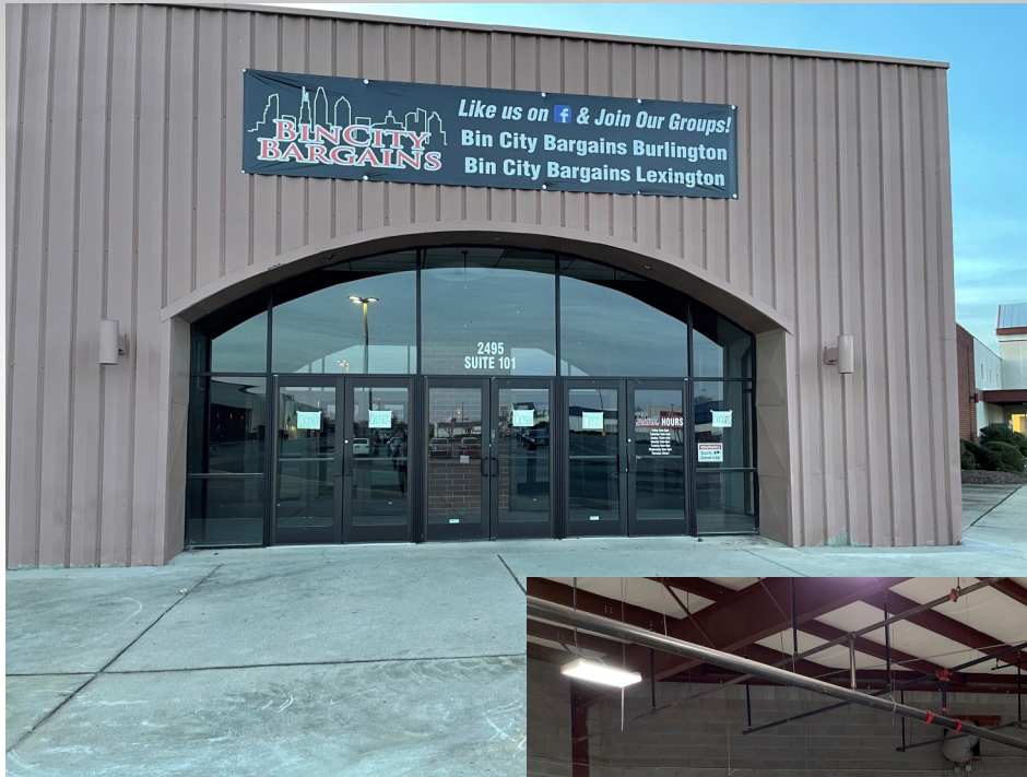
Inside Front Door