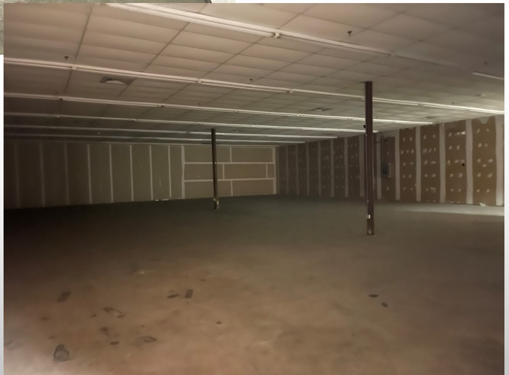
A 3rd Additional Room, Large with Separate Bathrooms