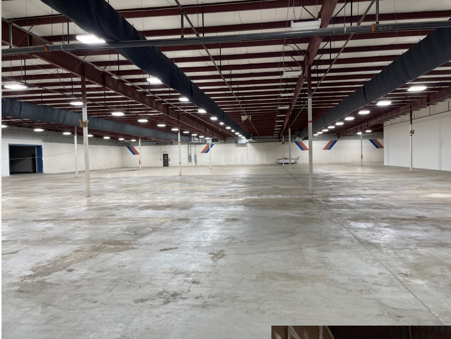
Front view towards Rear