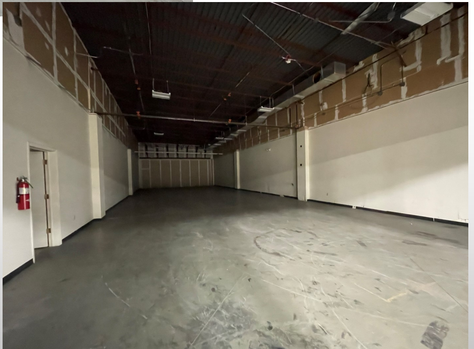
Attached side Room