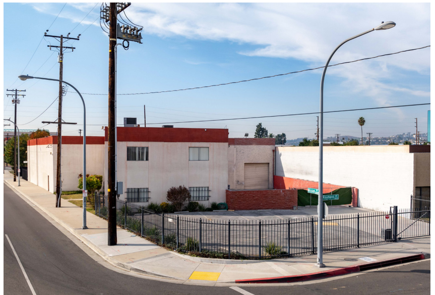
View of Property from Raymond Avenue