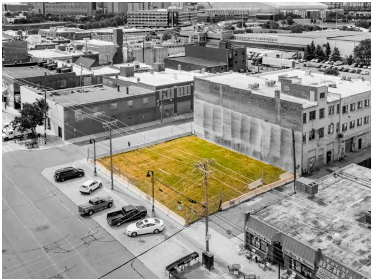
[CLOCKWISE FROM ABOVE] RUSSELL ST VIEW, WIDE VIEW LOOKING FROM RUSSELL, AND PARCEL OUTLINE