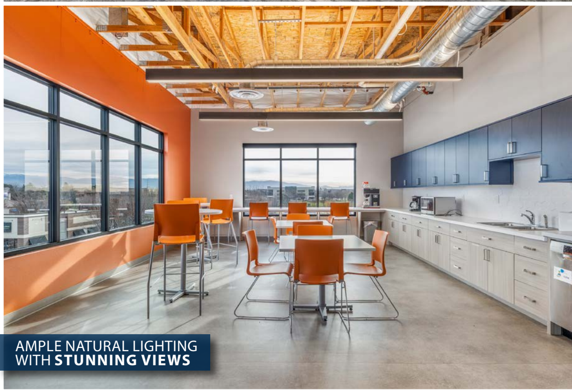
AMPLE NATURAL LIGHTING WITH STUNNING VIEWS