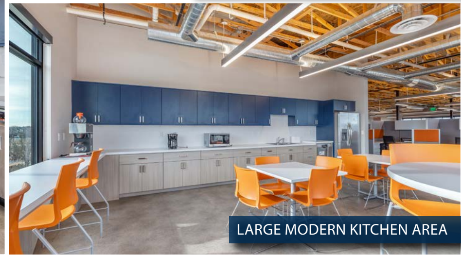
LARGE MODERN KITCHEN AREA