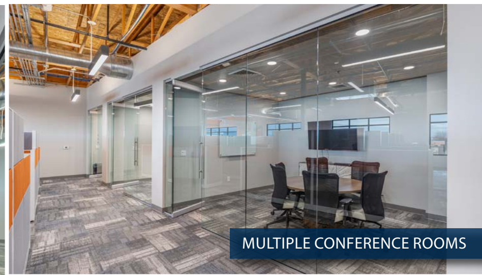
MULTIPLE CONFERENCE ROOMS