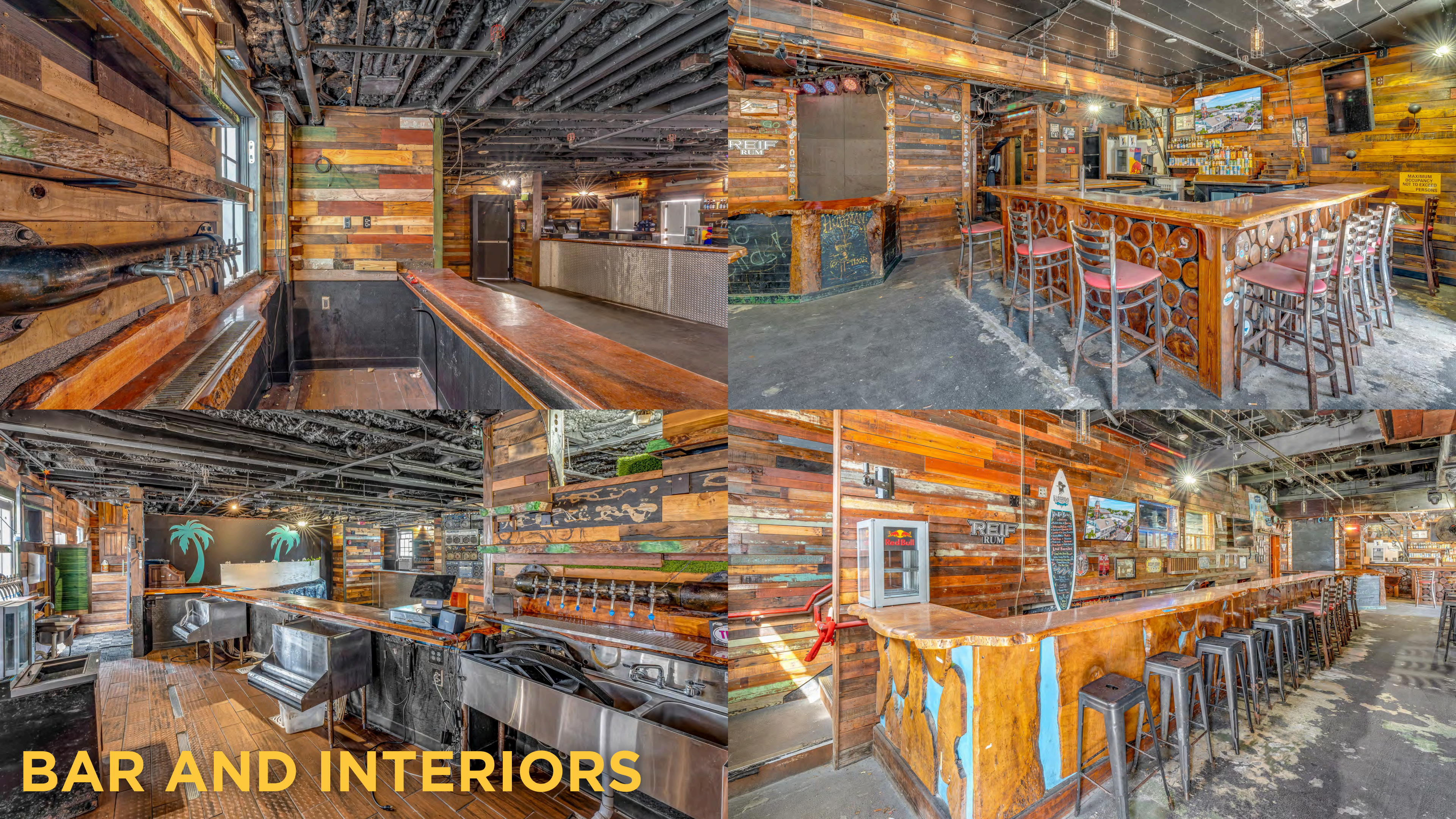
BAR AND INTERIORS