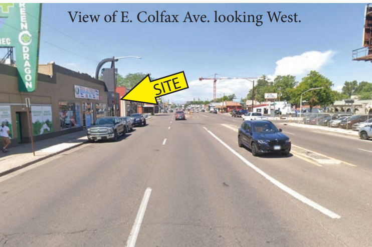
View of E. Colfax Ave. looking West.