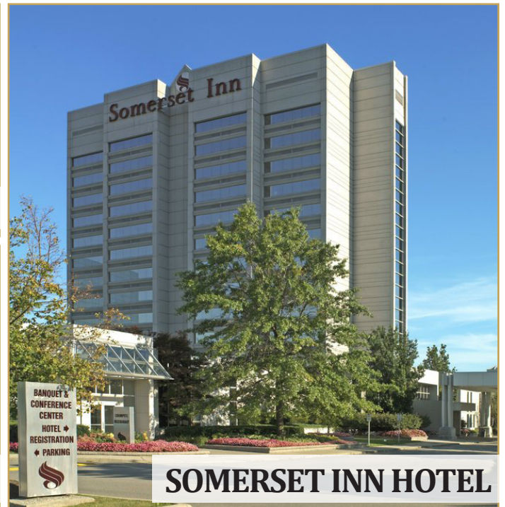
SOMERSET INN HOTEL