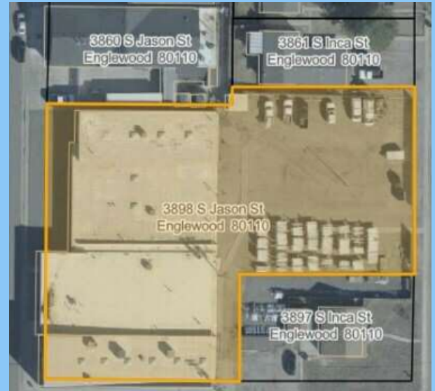
Parking LOT has different zoning. Potential development opp.