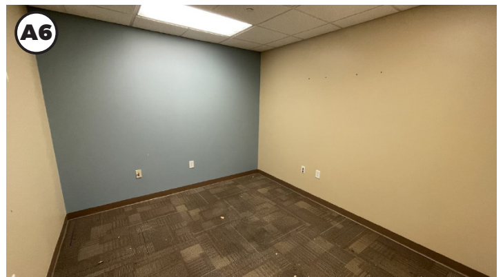
Office - Section A