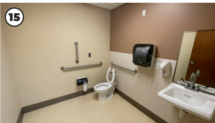
Bathroom (Rehab Section)