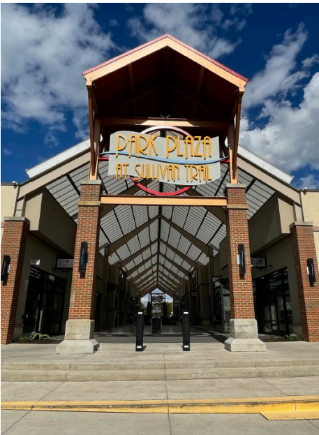
Plaza West Entrance

Park Plaza is a strategically located commercial and retail center in the heart of Forks Township, connected to Forks Township Community Park. Offering a mix of shopping, dining, and recreational opportunities, it serves as a vibrant alternative to the Lehigh Valley Mall and Promenade Shoppes. With 100,000 SF of leasable space, 80% of which is occupied, the Plaza enhances community life with flexible green spaces, fire pits, outdoor seating, and event programming.