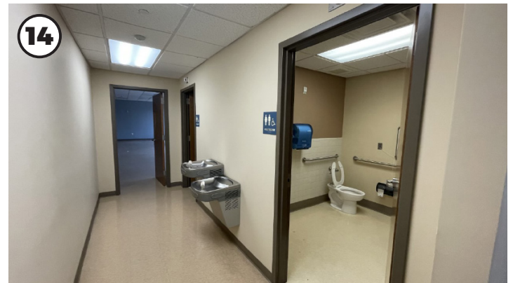
Bathroom (Rehab Section)