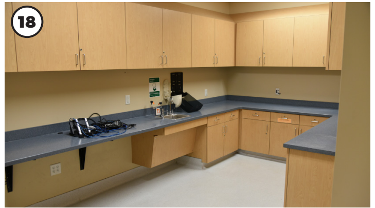
Blood Draw Lab