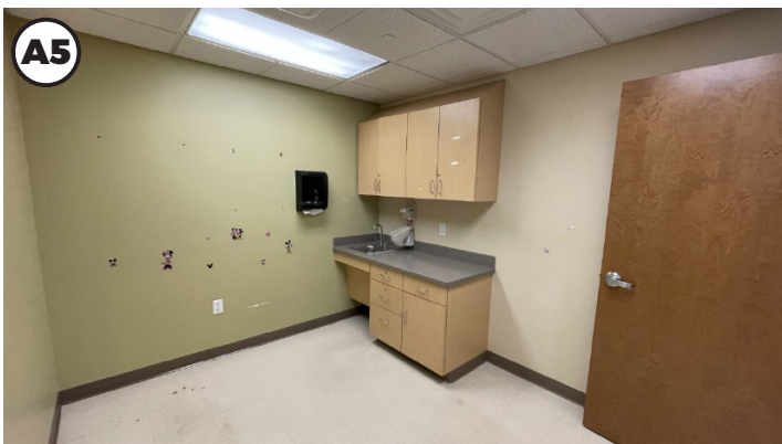
Exam Room Three - Section A