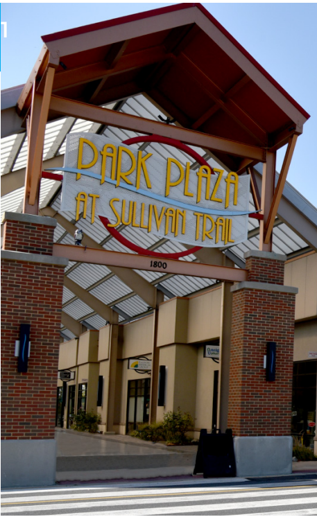
Plaza East Entrance