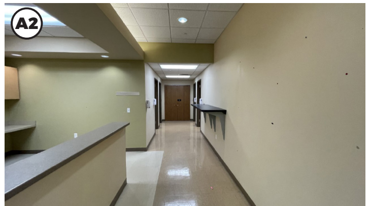
Main Hallway - Section A