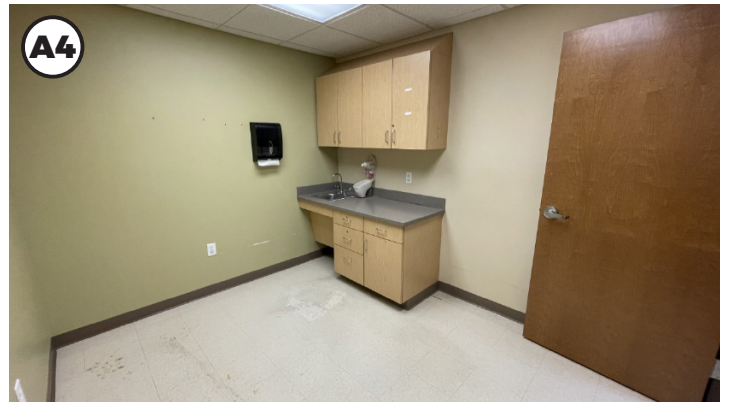
Exam Room Two - Section A