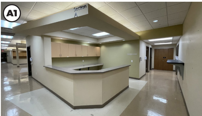
Reception - Section A