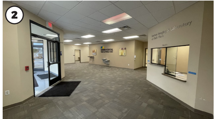
Main Atrium/Waiting Area