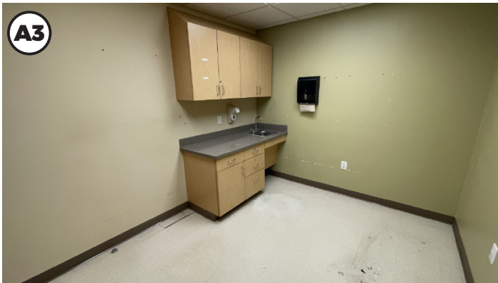
Exam Room One - Section A