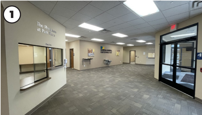
Main Atrium/Waiting Area