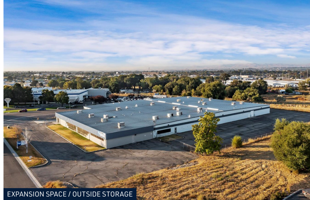
EXPANSION SPACE / OUTSIDE STORAGE