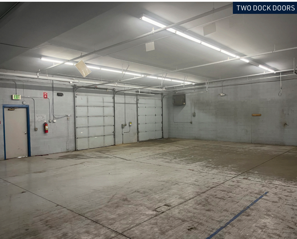
TWO DOCK DOORS